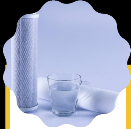
WATER RO FILTER