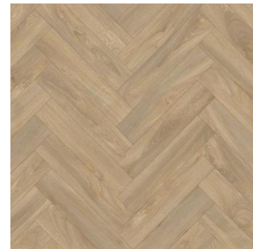
Laurel Oak - 116L