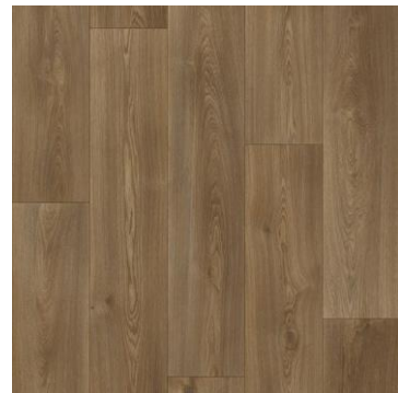
Columbian Oak - 649M