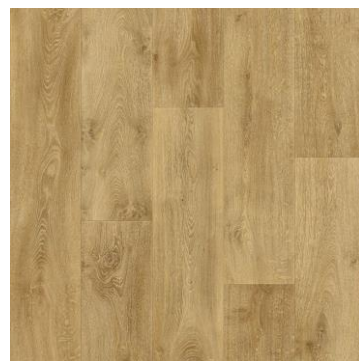
Texas Oak - 136L