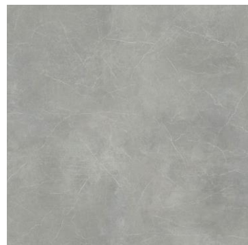
Rockingham - 790M