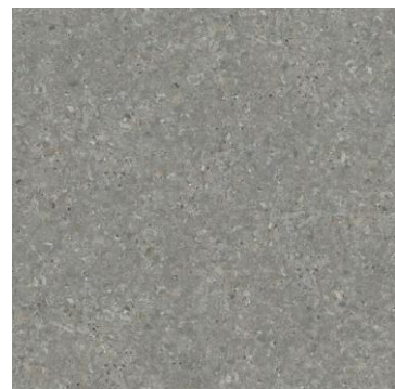
Nottingham - 119M