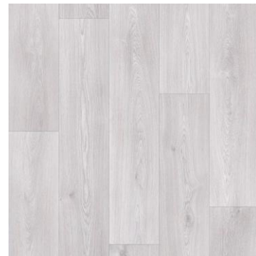
Columbian Oak - 910M