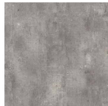
Zinc - 996D