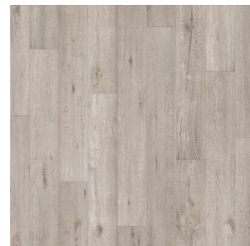
Tasmanian Oak - 096L