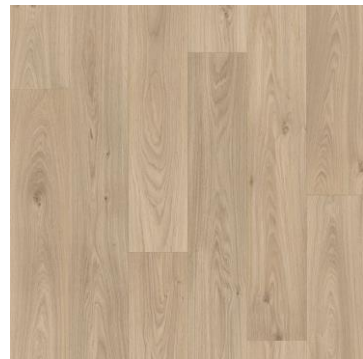
Gambel Oak - 119M