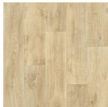
Texas Oak - 162L