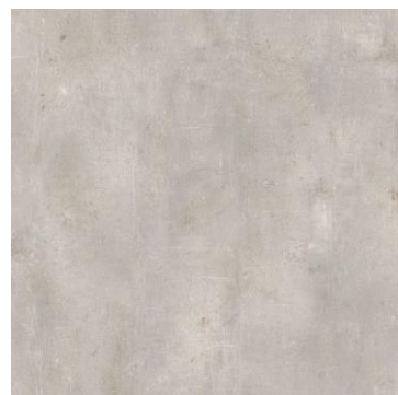
Zinc - 096L