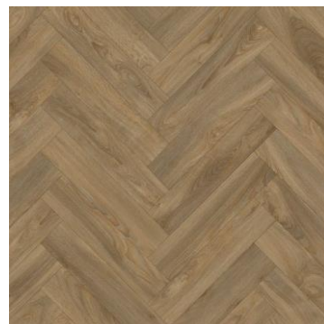
Laurel Oak - 669D