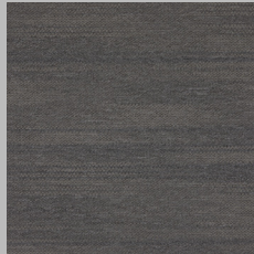
Comfort LRV: L=39.45 Y=10.92