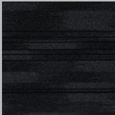
Strength LRV: L=23.23 Y=3.87