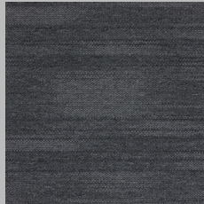
Solid LRV: L=35.87 Y=8.94