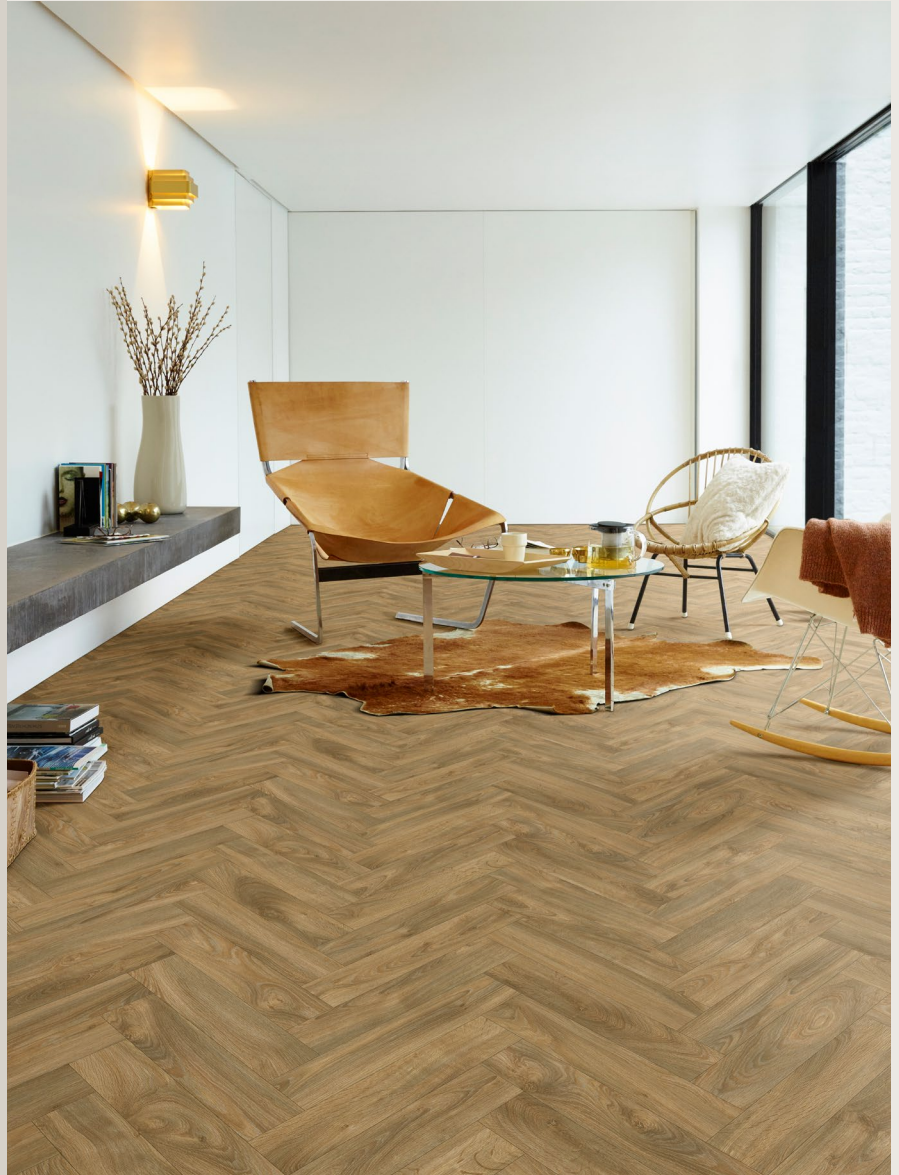
Strut - Laurel Oak