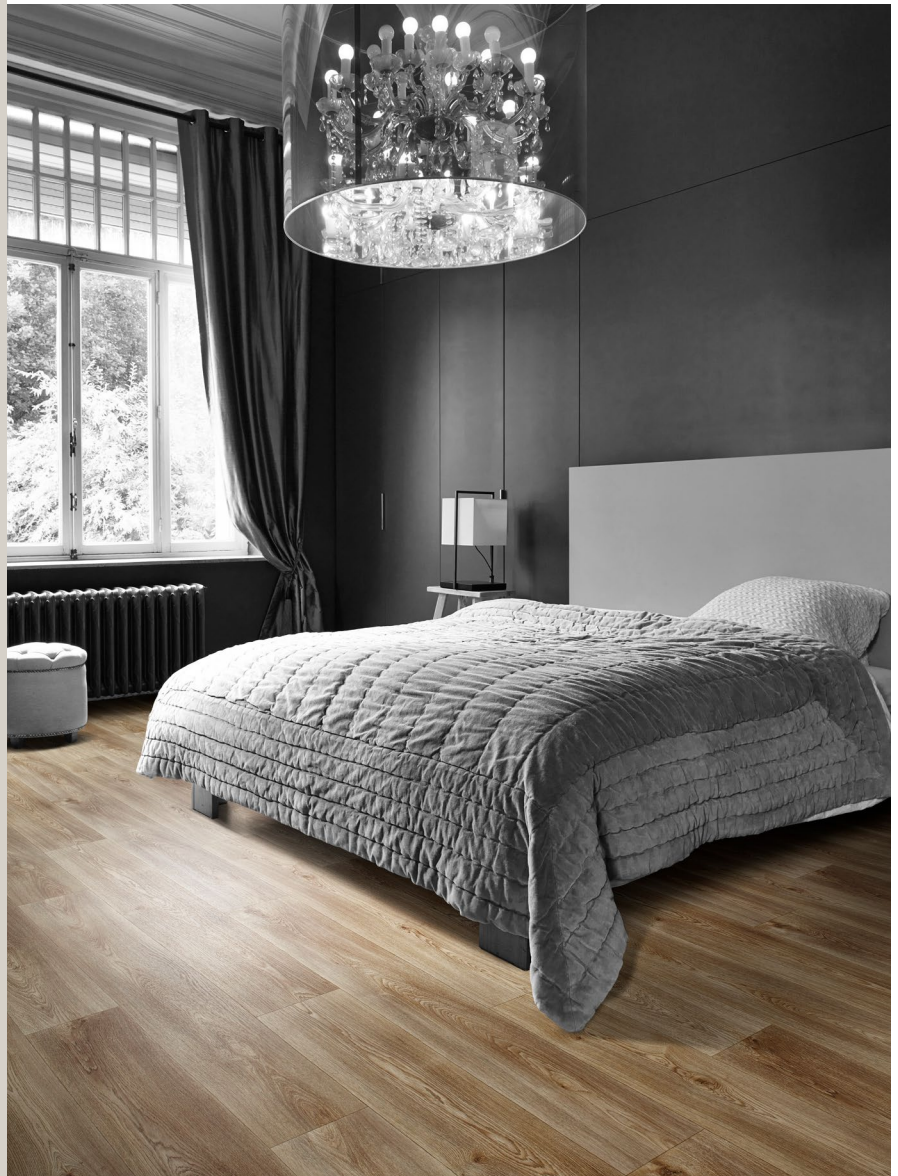
Strut - Columbian Oak