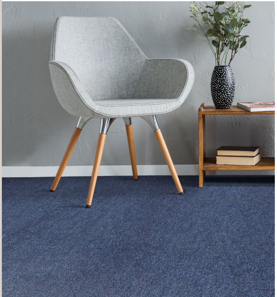
Color Rib - Blue Bottle