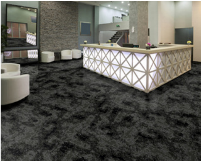
Figure 1 Structured Needlepunch Commercial Carpet

Belgotex is a leading South African carpet and artificial grass manufacturer.