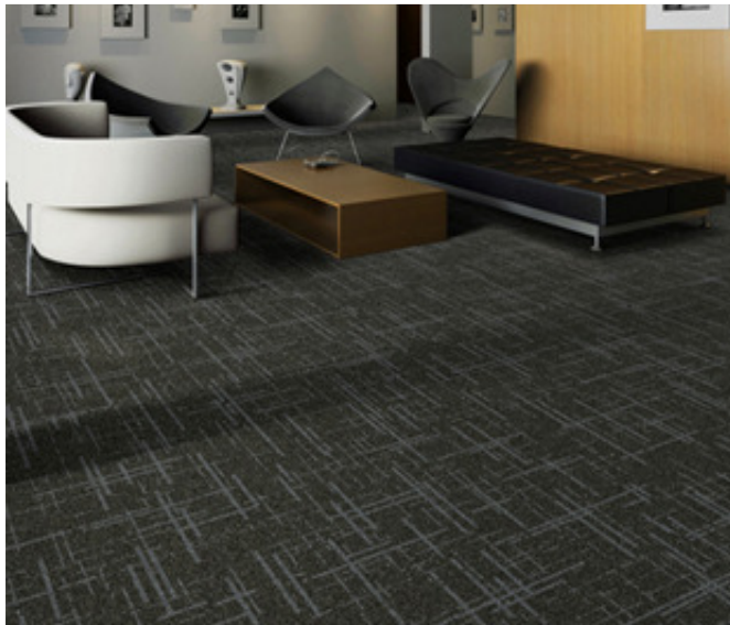
Figure 1 SDN Tufted Broadloom Carpet

Belgotex is a leading South African carpet and artificial grass manufacturer.