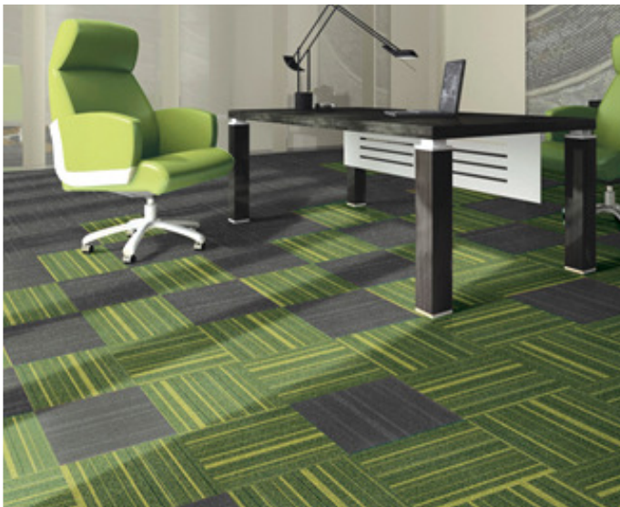
Figure 1 SDN Tufted Bitumen Backed Carpet

Belgotex is a leading South African carpet and artificial grass manufacturer.