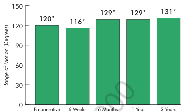
Figure 1: Mean range of motion pre-operatively, at 6 weeks, 6 months, 1 year, and 2 year follow-up.

Range-of-motion was improved by an average of 11° from 120° pre-operatively to 131° at 2 years post-op (116° at 6 weeks, 129° at 6 months, and 129° at 1 year) (Figure 1). Patients demonstrated marked improvements from baseline scores across all measured domains. A total of 88 patients have reached their 2-year follow-up to date. Average scores at the 2-year interval are as follows: KSS Knee Score - 94, KSS Function - 91, scaled WOMAC - 90, and VAS Pain - 1.3 (Figure 2). Additionally, 99% of patients said they were satisfied with their UKR (89% reporting they were very or extremely satisfied) and 89% stated that the movement of their knee felt natural (Figure 3). To date, 2 patients have undergone revision for tibial loosening and 2 additional patients were revised for disease progression yielding a cumulative revision rate of 3.3% at an average follow-up of 2 years.