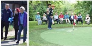
Spring and summer fun at VHRC included the grand opening of the Sport Park Fire Pit, June Art Show, a Walk to End Alzheimer's around campus, and a Throw for Show, Putt for Dough putting contest on the VHRC green.

There are so many fascinating people at VHRC – with fascinating stories to tell! The latest edition of Campus News & Views , Vinson Hall and Willow Oak's quarterly literary magazine, is brimming with wonderful stories, remembrances and poems. Highlights include a resident's recollections of his father's role in laying Al Capone to rest, and a young GI's terror after being recruited to join an Army jazz quartet and play an instrument he had never touched. Another resident recalls her tender encounter with an orphan elephant in Sri Lanka, while an ambassador shares a speech she gave in Papua New Guinea in memory of the Battle of Guadalcanal, followed