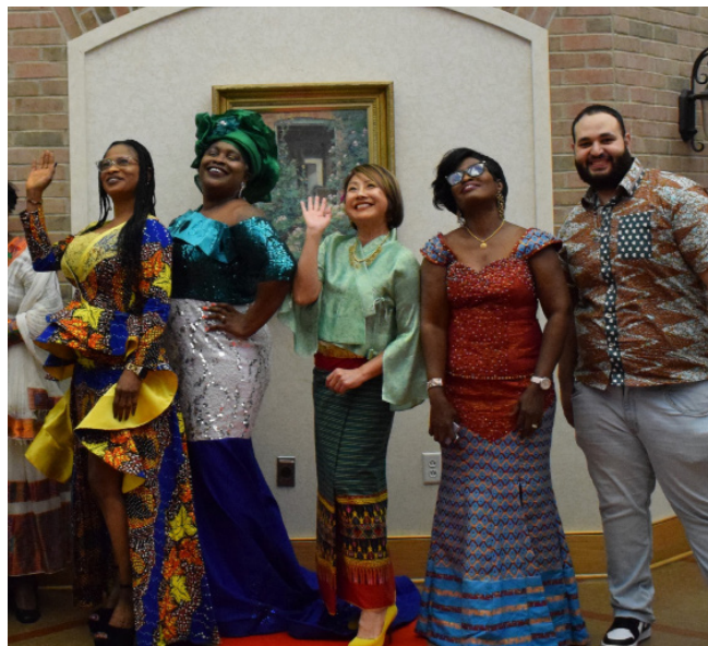
Arleigh Burke Pavilion staff share their heritage at an International Fashion Show.