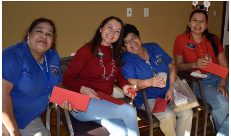
Employee Appreciation Fund gifts were distributed to VHRC staff at an end-of-year holiday party.