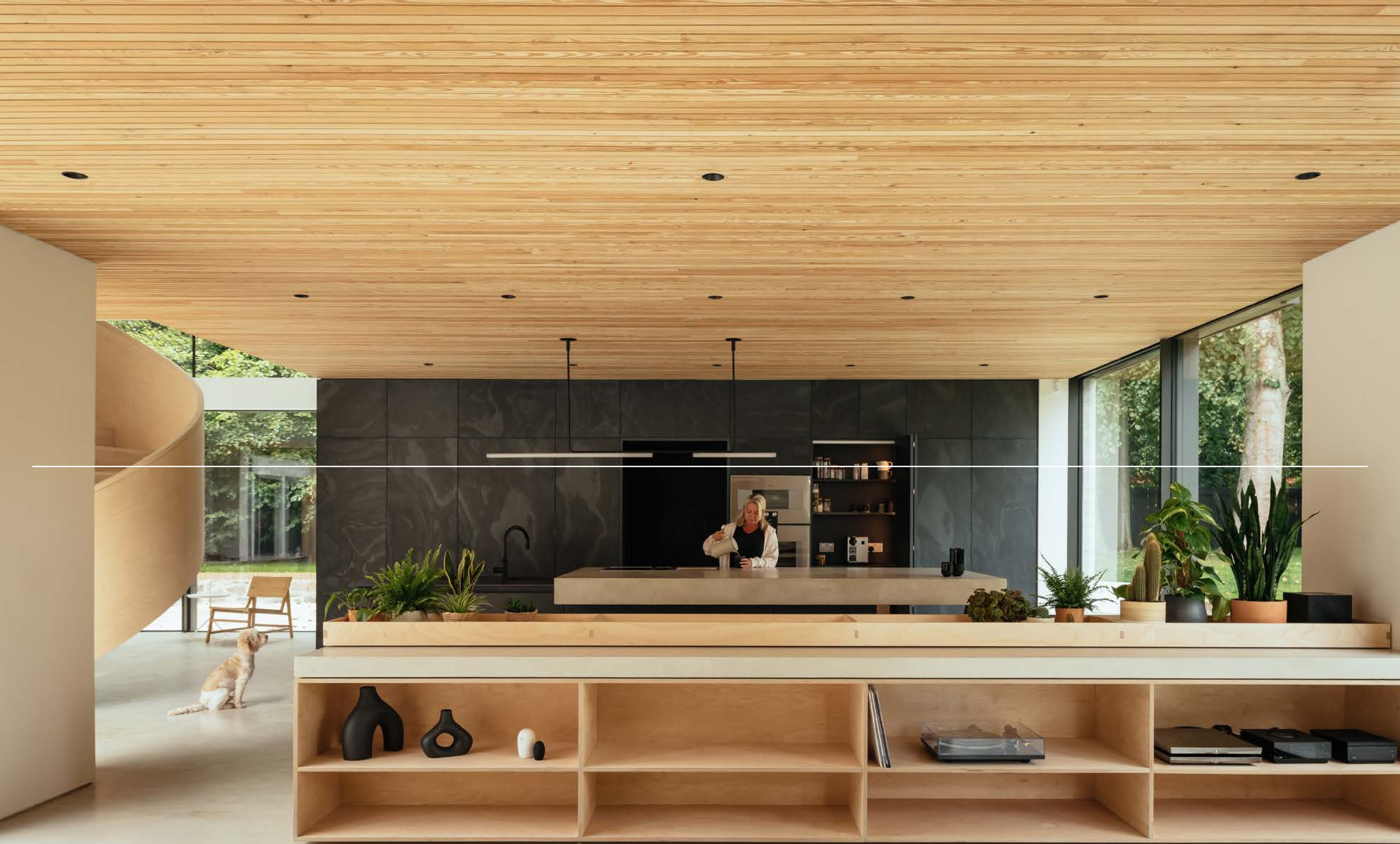
The Arbor House, Aberdeen