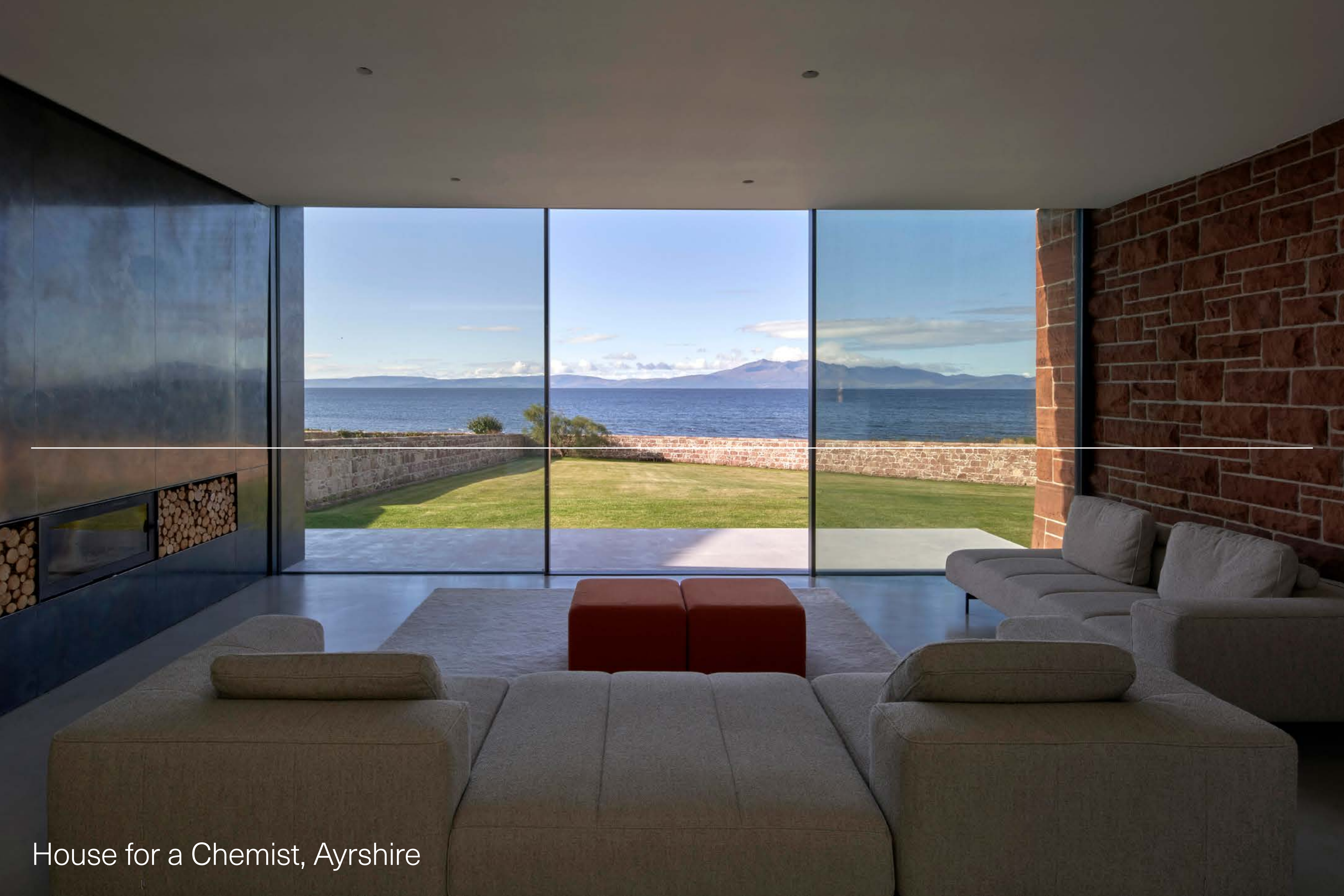
House for a Chemist, Ayrshire