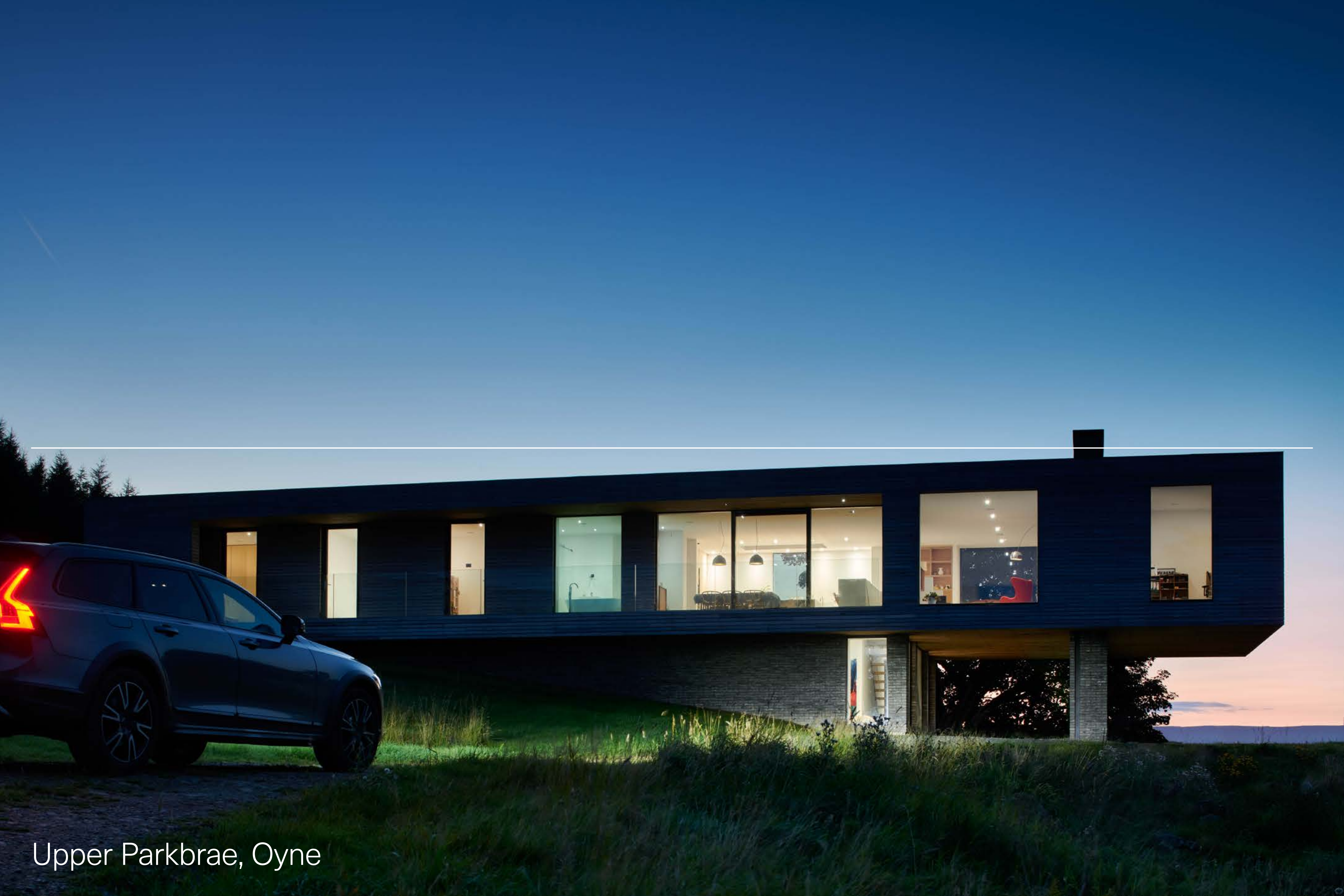
Upper Parkbrae, Oyne