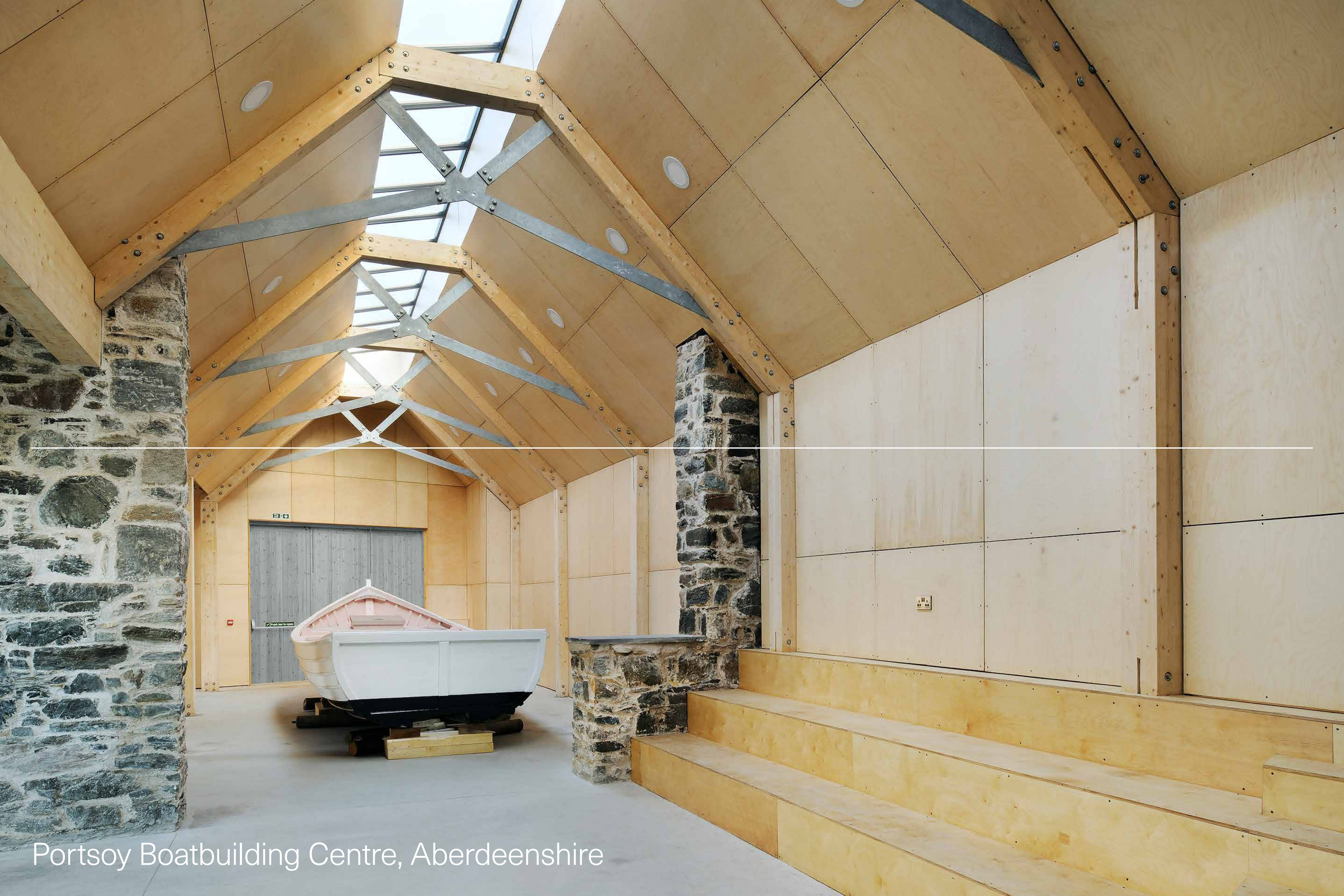
Portsoy Boatbuilding Centre, Aberdeenshire