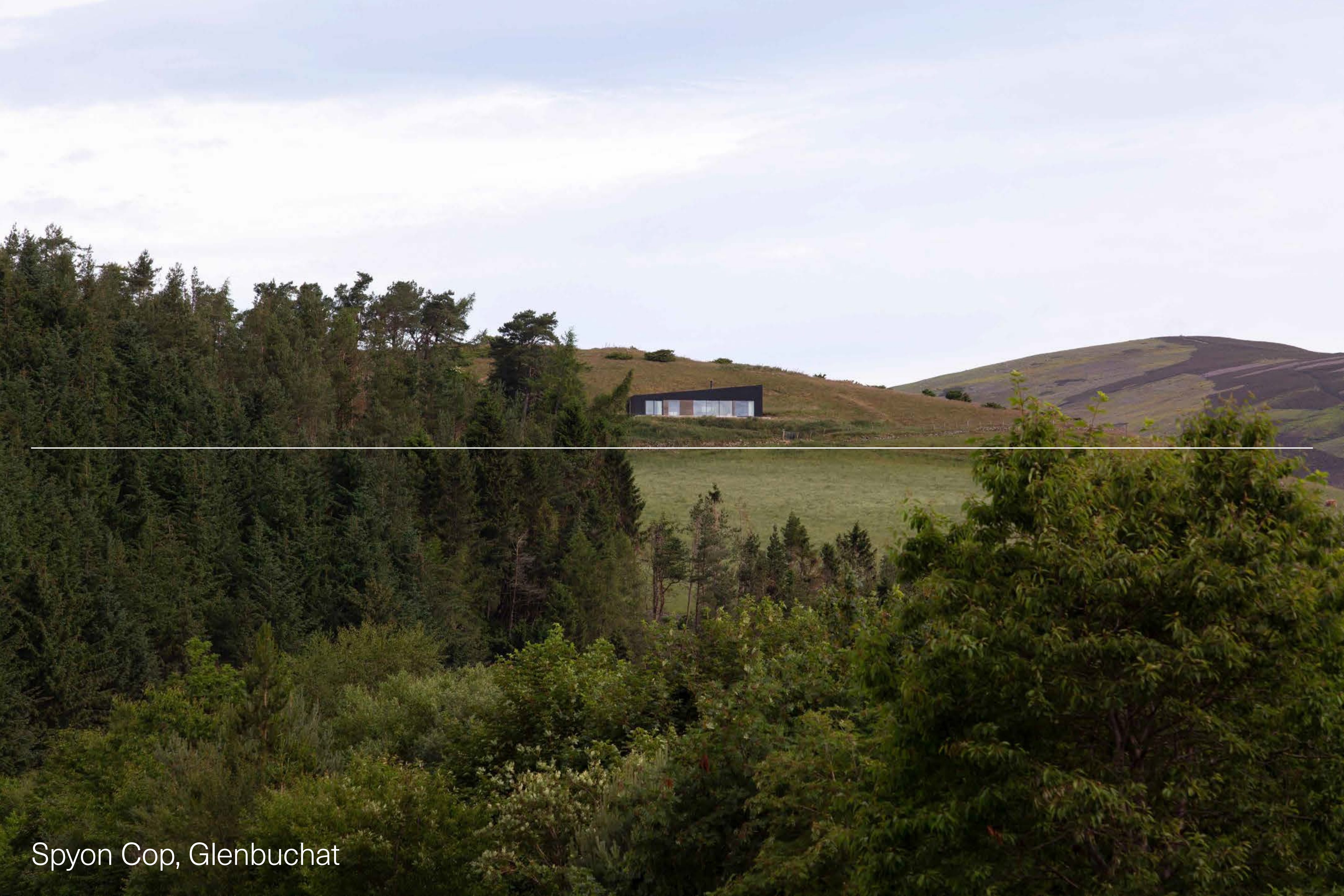
Spyon Cop, Glenbuchat