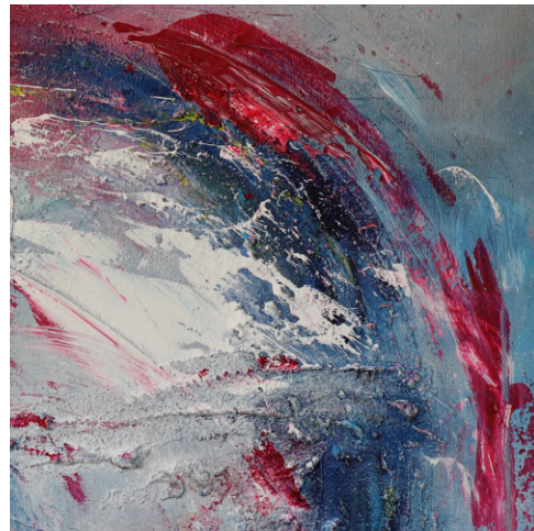
Life 2023 Mixed media on canvas 50 x 50cm