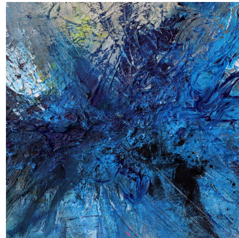
Silent explosion 2023 Mixed media on canvas 50 x 50cm