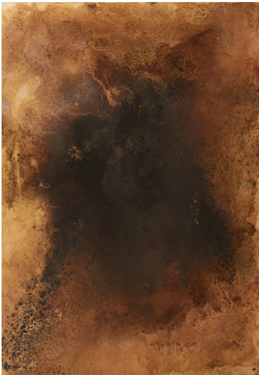
Error number 2 2023 Mixed media on canvas 100 x 70cm