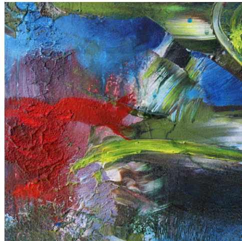
New winds 2023 Mixed media on canvas 50 x 50cm