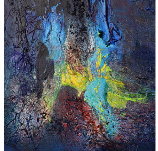
Fire is blue 2023 Mixed media on canvas 50 x 50cm