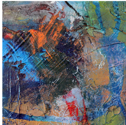
The reflection of Jupiter in the sea 2023 Mixed media on canvas 50 x 50cm