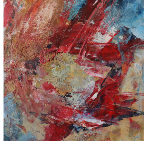
Water sands 2023 Mixed media on canvas 80 x 80cm