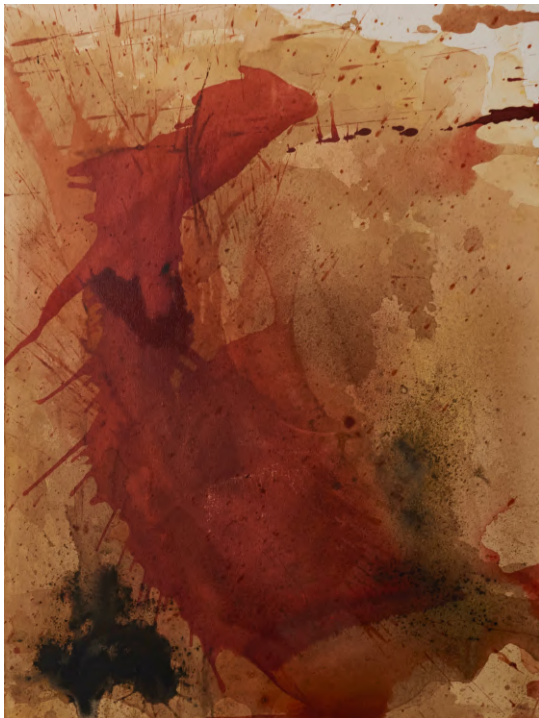
Error number 4 2023 Mixed media on canvas 80 x 60cm