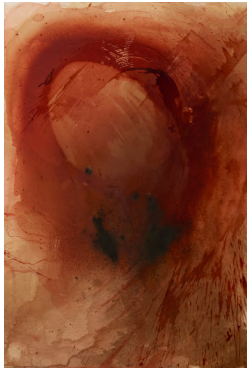
Error number 3 2023 Mixed media on canvas 90 x 60cm