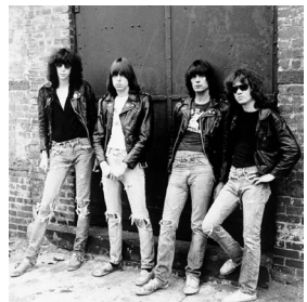
a 70's album cover