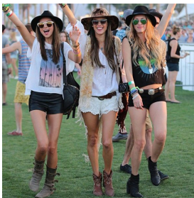
a music festival