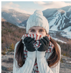
a winter hike