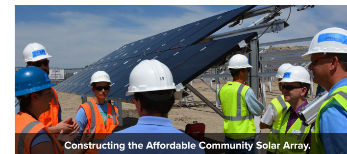
Constructing the Affordable Community Solar Array.