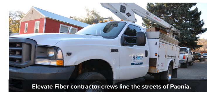
Elevate Fiber contractor crews line the streets of Paonia.