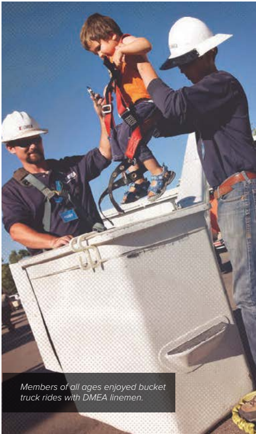
Members of all ages enjoyed bucket truck rides with DMEA linemen.