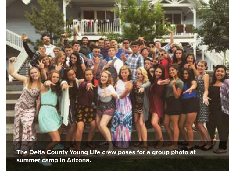
The Delta County Young Life crew poses for a group photo at summer camp in Arizona.