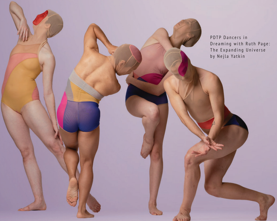
PDTP Dancers in Dreaming with Ruth Page: The Expanding Universe by Nejla Yatkın

Audition for PDTP during the International Dance Experience Audition Tour!