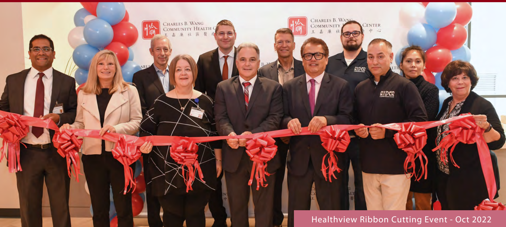
Healthview Ribbon Cutting Event - Oct 2022