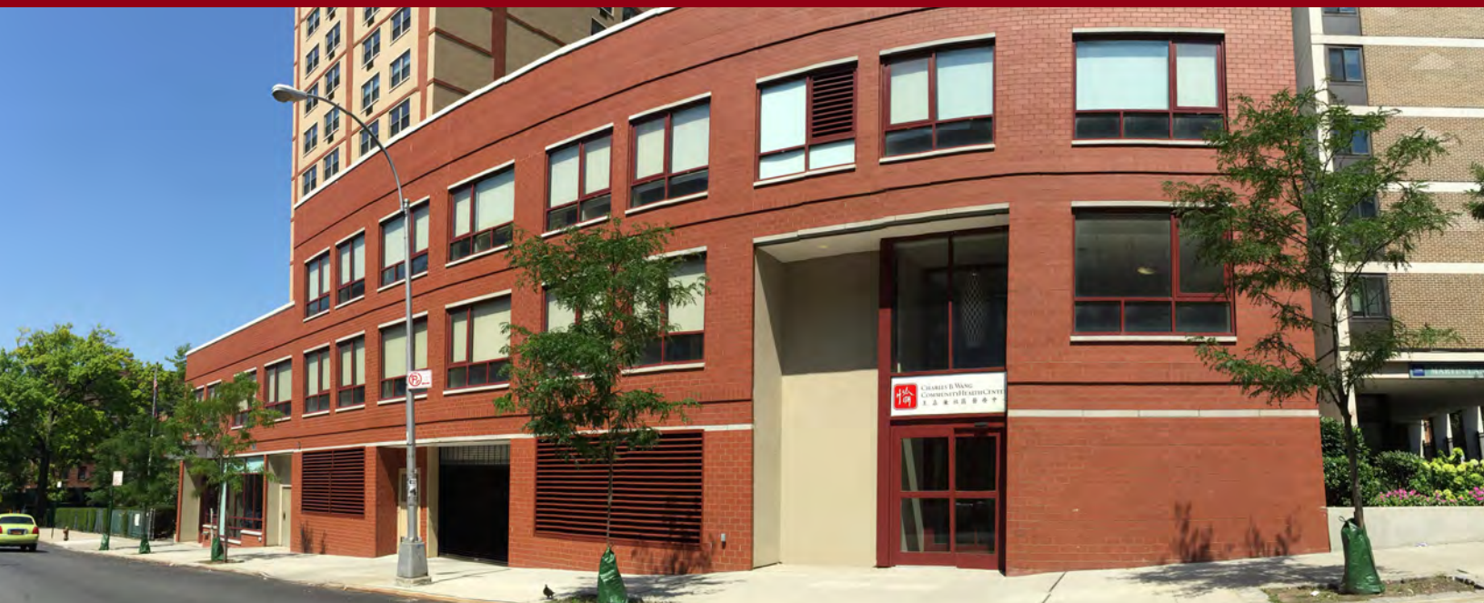
Charles B. Wang Community Health Center site at 137-43 45th Avenue, Flushing.