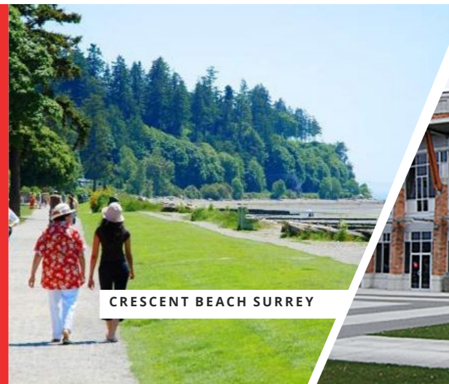
CRESCENT BEACH SURREY