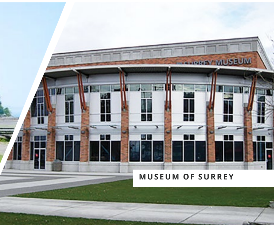
MUSEUM OF SURREY