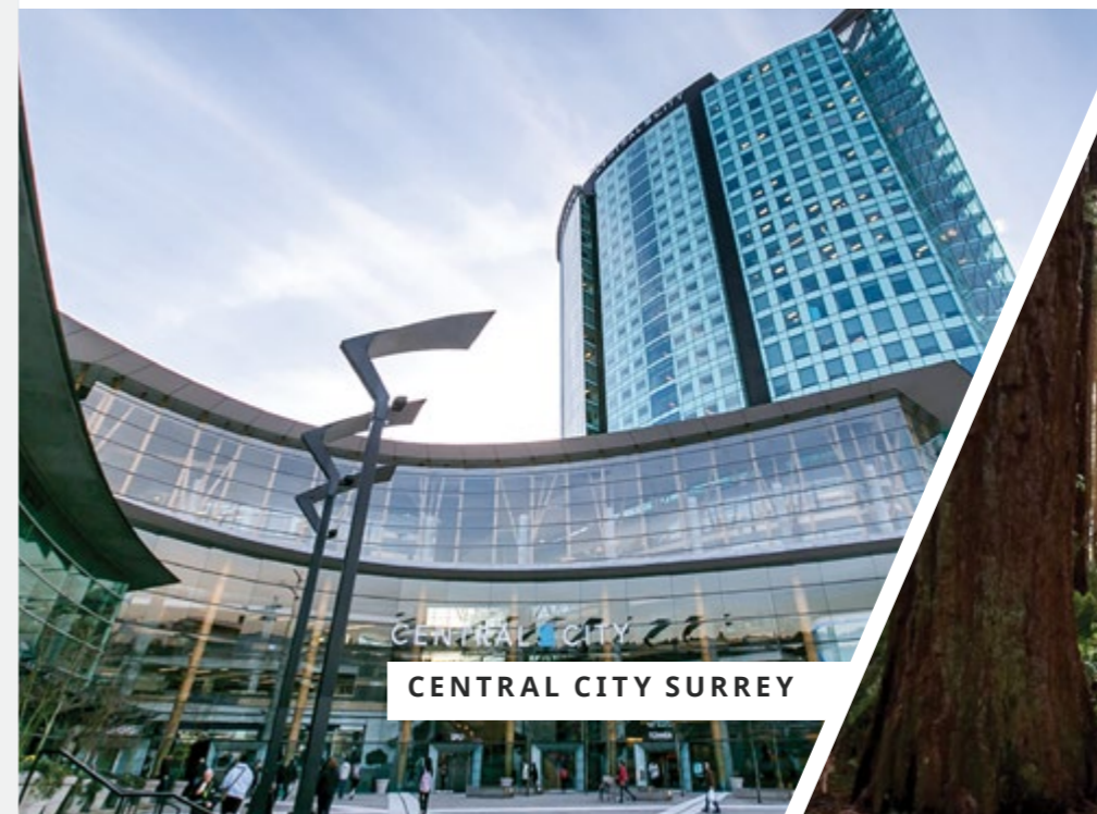
CENTRAL CITY SURREY