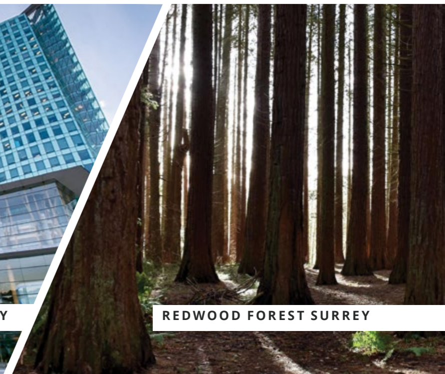
REDWOOD FOREST SURREY