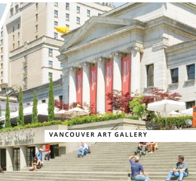
VANCOUVER ART GALLERY