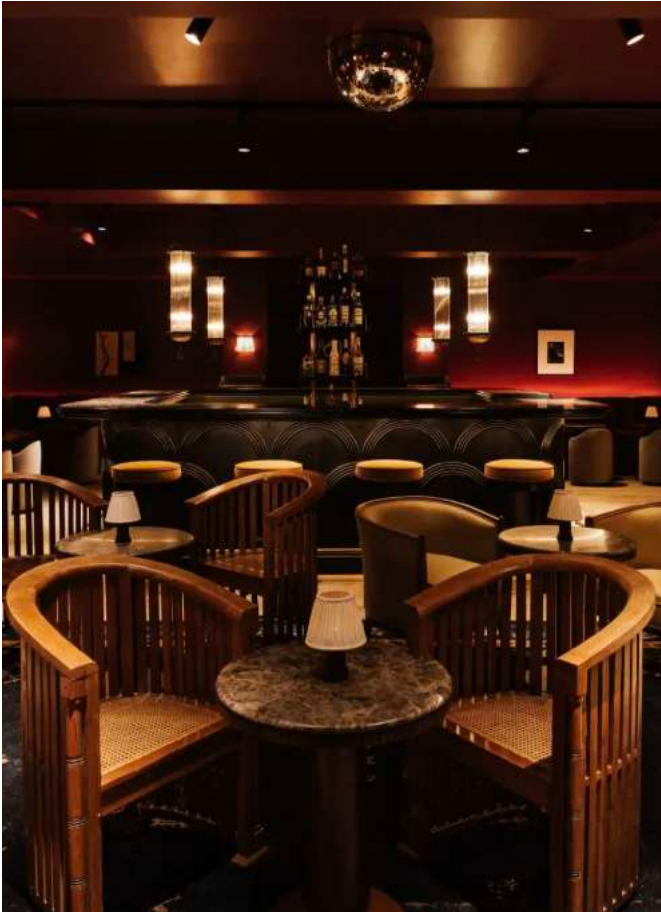
As of 2020, Hôtel Rochechouart now houses three distinct culinary offerings: the esteemed Restaurant Rochechouart, the breathtaking Bar sur le Toit de Rochechouart, and the speakeasy dance hall Le Mikado Dancing.

Restaurant Rochechouart is bringing the boulevard back to life, just as it did for many years prior. After a major renovation overseen by the prestigious French architecture firm Festen, the historical hotspot continues to welcome diners within the same splendor of its Art Deco surroundings.