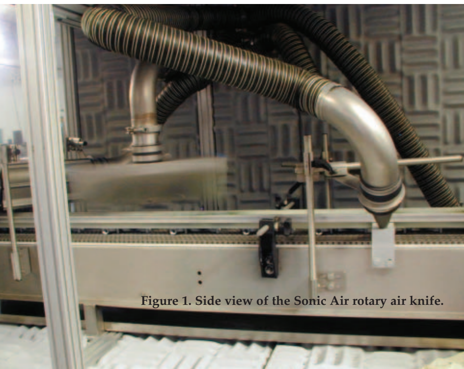
Figure 1. Side view of the Sonic Air rotary air knife.

In addition, Marshall Gas has realized significant power savings since implementing the dryer.