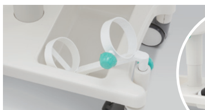
Atom's code: 26411