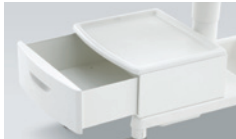
Opening the drawer