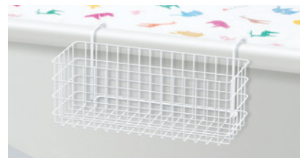
Atom's code: 26117