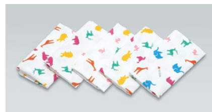
Atom's code: 26122