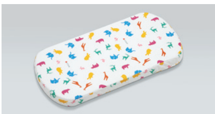
Atom's code: 26118