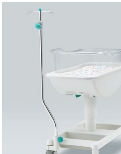
Atom's code: 26113