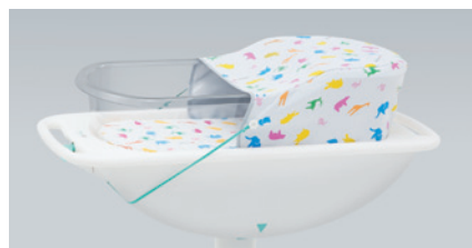
Atom's code: 26123