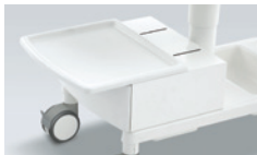
Sliding open the top slide tray