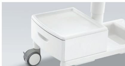
Atom's code: 26114