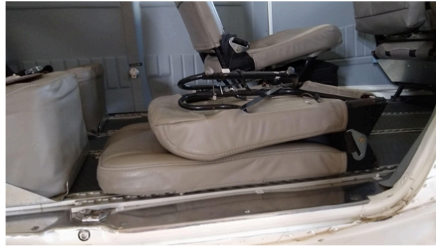
Middle seat in folded position

The seats are not only crashworthy but also highly adaptable. They can be easily removed and reinstalled in various cabin configurations. What's more, unused passenger seats can be conveniently folded and stored in the aircraft's cargo compartments, adding a layer of flexibility for operators.