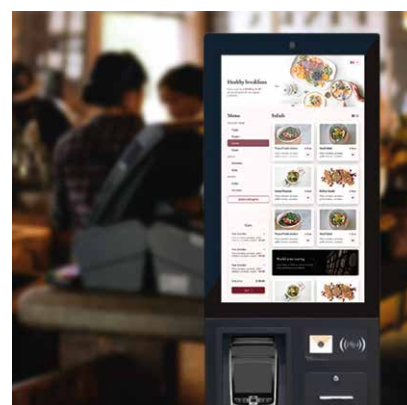
Hotels & restaurants