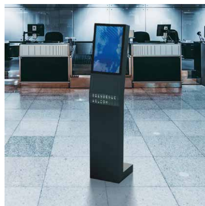
Airports & stations