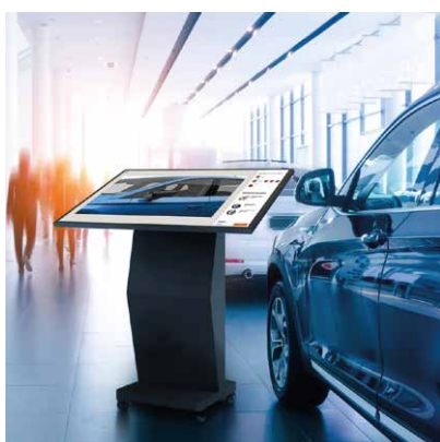
Gas stations & concessions