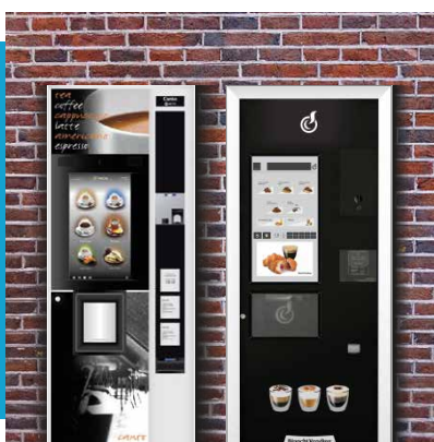
Self-services & kiosks