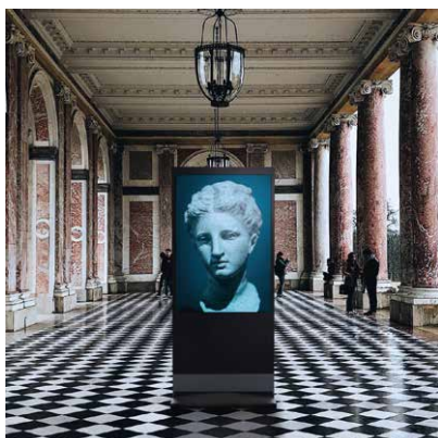
Movies & museums