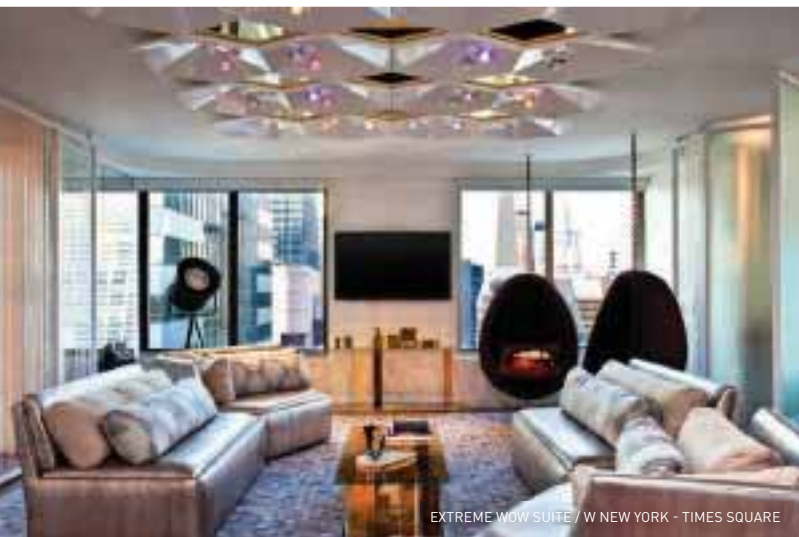
EXTREME WOW SUITE / W NEW YORK - TIMES SQUARE