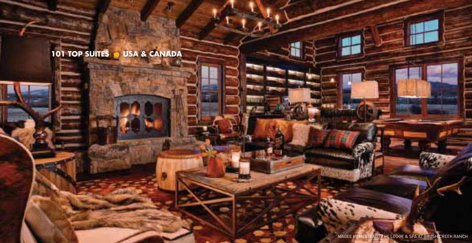
MAGEE HOMESTEAD, THE LODGE & SPA AT BRUSH CREEK RANCH