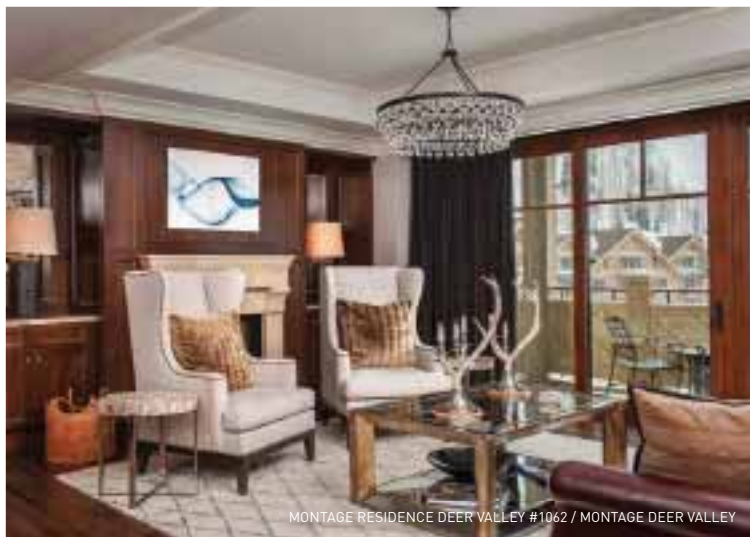
MONTAGE RESIDENCE DEER VALLEY #1062 / MONTAGE DEER VALLEY