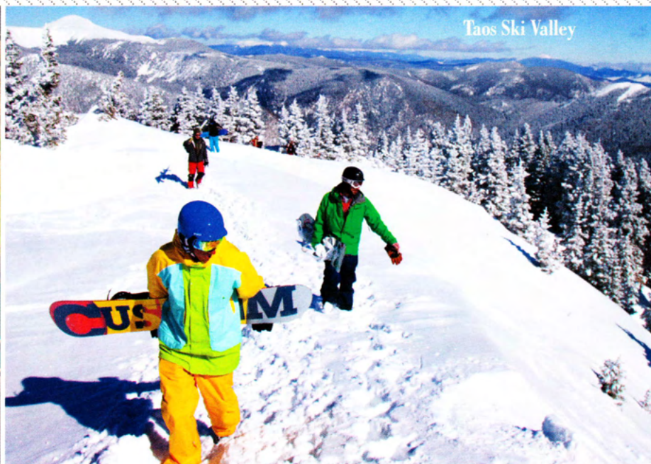
Taos Ski Valley