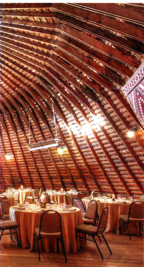
➡ Left: The Adobe Round Barn at Ojo Caliente Mineral Springs Resort & Spa was built in 1924 and is on the National Register of Historic Places. Right: Floating over Napa Valley is a sure way to get creative juices flowing.