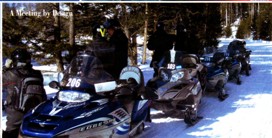
A Meeting by Design