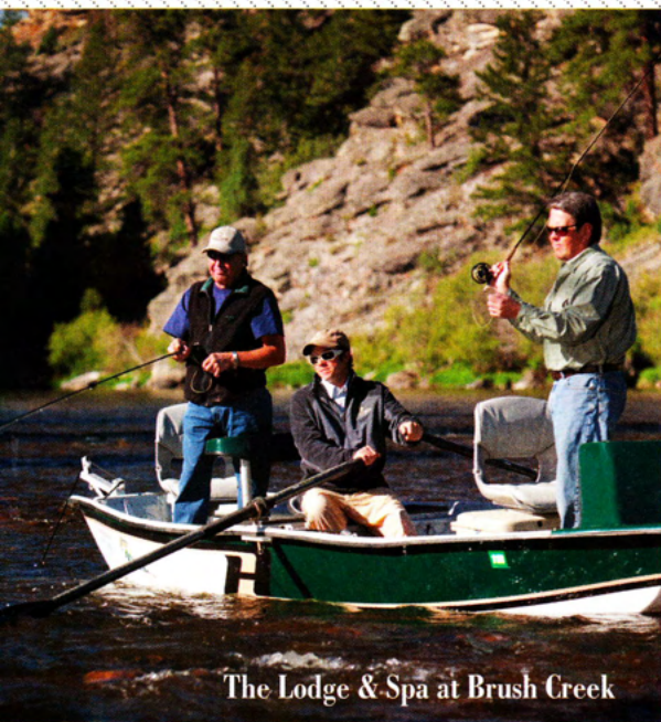
The Lodge & Spa at Brush Creek