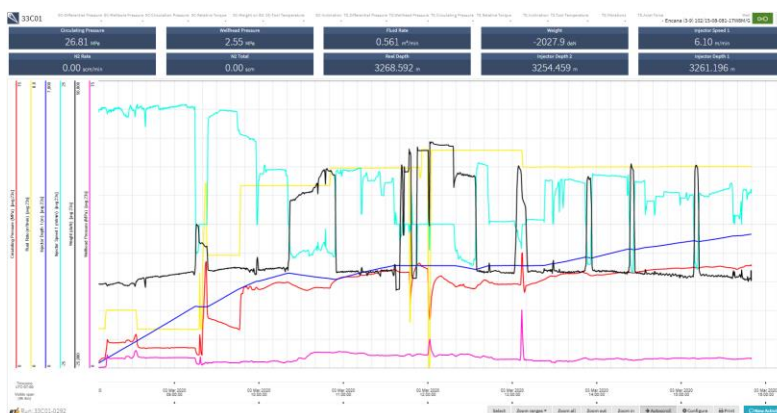
Figure 1: Live IDEX Data Chart Trend