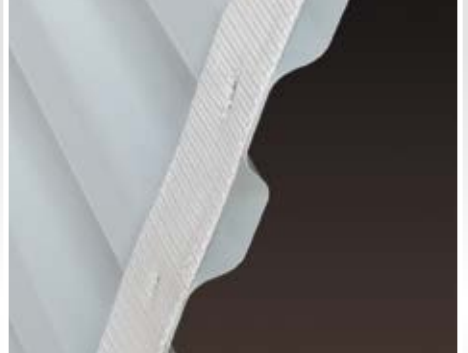
Corrugated Panel Design (Model 157C Shown)