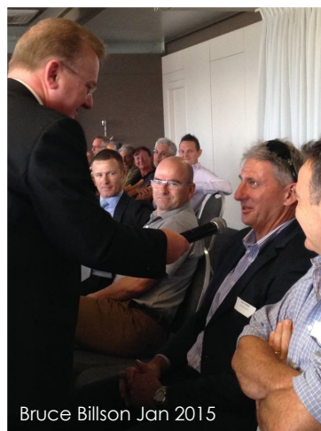
Bruce Billson Jan 2015