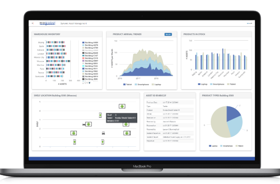
Figure 3-5 Visi-Trac Platform

The Visi-Trac Asset Manager is an integrated RFID-centric evidence management system. Knot Technology Solutions (KTS) partners with the Visi-Trac manufacturer, RFID Global Solution, to provide evidence management software, services and support. Using RFID technology, Visi-Trac Asset Manager is designed to track the movement and locations of evidence and property to maintain chain of custody and inventory accuracy. Visi-Trac records and stores pertinent evidence and asset data using fixed and mobile readers to record and report the last location and custody information. KTS offers third-party passive tags, semi-active tags, active tags, GPS- and cellular-