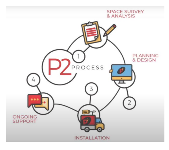
Figure 3-7 Patterson Pope Process

All RFID Solutions systems come with a one year warranty that covers all aspects including software, hardware, support, and training. After the first year, an annual maintenance agreement is available for purchase, which covers support, training, and software updates. The annual maintenance agreement is a negotiated percentage of the cost of the initial system. The Patterson Pope support line is open Monday through Friday, 8 a.m.-5 p.m. Eastern time.