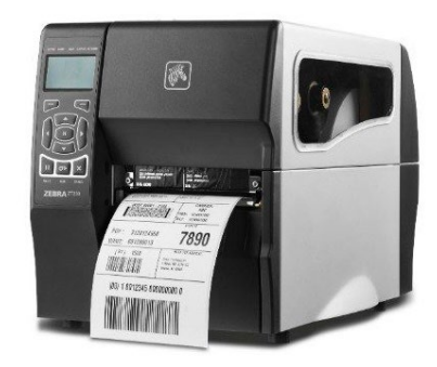
Figure 2-4 Zebra ZT430 RFID Printer