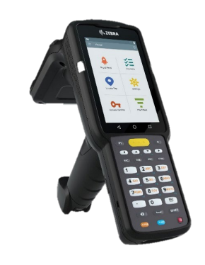
Figure 2-5 MC3300 RFID Handheld Reader

Most RFID evidence management systems use third-party handheld RFID readers (Figure 2-5). A typical RFID handheld reader resembles the wireless barcode scanners often seen at retail store checkouts but include an antenna module. They feature a touchscreen, rechargeable lithium-ion batteries, and linearly polarized or circularly polarized antennas. Handheld readers typically allow the user to manage some reader functions and control some database input parameters. Some readers achieve a similar functionality via a smartphone holder and RFID application (or "app") that link to the reader's power and antenna module via Bluetooth. Some handheld readers have the capability to scan both RFID tags and traditional optical barcodes, useful to agencies new to RFID technology and wishing to maintain operational redundancy with existing barcode inventory or evidence management systems.