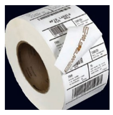
Figure 2-3 Passive RFID Labels