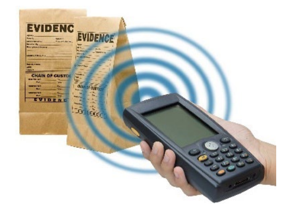
Figure 3-1 PADtrax Evidence Management

The PADtrax RFID Evidence Management System is a complete integrated RFID-centric evidence management system available from C&A Associates, Inc. PADtrax, which stands for "People, Asset, Document Tracking," is specifically designed to meet law enforcement evidence management needs. The PADtrax RFID Evidence Management System offers PADtrax software, handheld and portal RFID readers, and passive RFID tags. PADtrax software provides a complete chain of custody for evidence items from seizure through final disposition. The PADtrax RFID Evidence Management System can also manage agency assets.