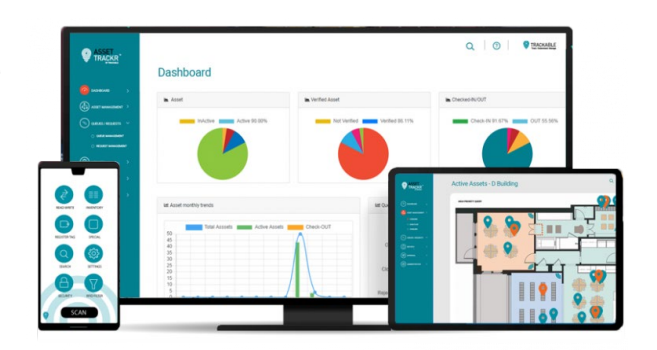
Figure 3-9 Evidence Trackr Platform

Evidence Trackr is an RFID-centric evidence management system available from Trackable IoT. The Evidence Trackr Evidence Management System is an integrated system that includes software, RFID handheld readers, portal RFID readers, and RFID tags. Evidence Trackr supports passive, semi-active, and active RFID tags. Evidence Trackr is specifically designed to meet law enforcement evidence management needs. Evidence Trackr can also integrate with digital scales, alarms, electronic signature pads, fingerprint readers, and video cameras. Evidence Trackr can be used to track evidence, weapons, narcotics, currency, and vehicles.