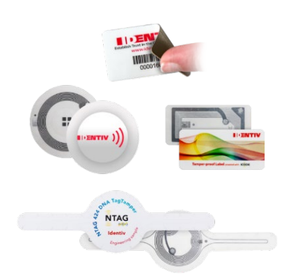
Figure 2-2 Passive RFID Tags

The cost of passive RFID tags varies based on features and quantity purchased. Basic passive RFID tags for non-metal surfaces can be priced as low as $0.05 per tag. Specialty passive RFID tags can be used to avoid interference with metal surfaces or liquid containers and cost several dollars each [2]. Passive