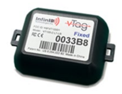
Figure 3-2 AssetWorx V-Tag

AssetWorx, manufactured by InfinID and distributed by Falken Secure Networks, is a scalable evidence software solution with custom RFID integration. AssetWorx can manage RFID tag printing, evidence registration with customer-definable alerts, chain of custody, and location tracking. AssetWorx integrates with barcode, passive RFID, semi-active temperature logging RFID, active "V-Tag" RFID, beacon tags, portal RFID sensors, handheld RFID readers, and other sensors for asset tracking and location. The system is crime scene portable. AssetWorx is web-based and can be accessed in the field from mobile web browsers running on smartphones or tablets.