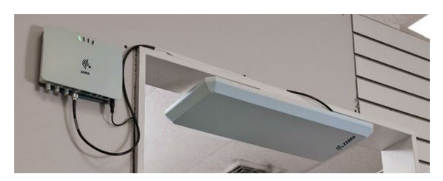
Figure 2-6 Fixed doorway RFID reader

Portal RFID readers work on the same principles as handheld RFID readers but are installed in a fixed location, such as police station evidence rooms, courtroom evidence lockers, or between storage and examination areas in forensic laboratories. Portal RFID readers can be deployed at "choke points" (e.g., doorways, windows, or other access points) that evidence must pass through when being checked-in, checked-out, or