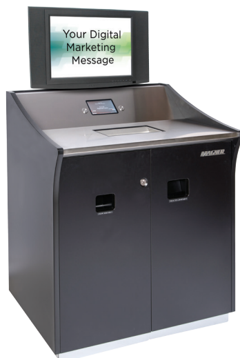
Model 909 illustrated with optional (or your) Digital Marketing screen