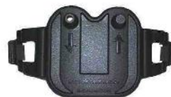
Aspirator plate Sample atmosphere prior to entry