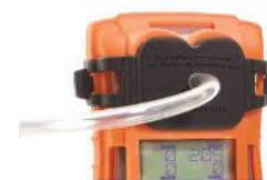
Bump/calibration plate To apply test gas to T4