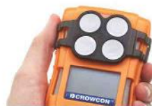
External filter plate Clip-on filter for dusty environments