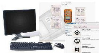
NEW Portables Pro 2.0 Software For easy configuration and servicing