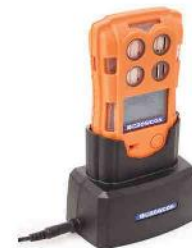
Cradle charger Docking station for easy charging