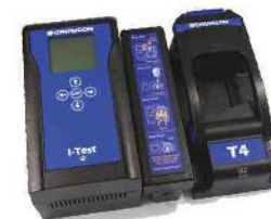
I-Test Easy automated bump testing and calibration solution