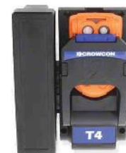
Vehicle charger Effective charging and storage while travelling