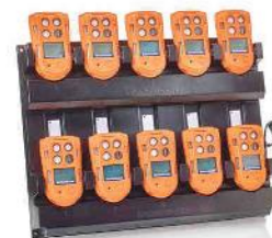
10 way charger For charging and storing your T4 fleet