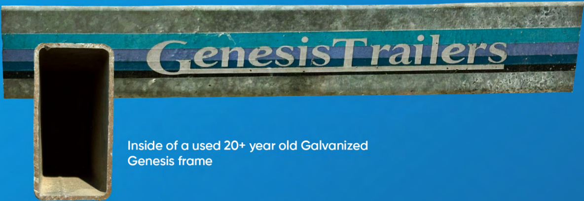
Inside of a used 20+ year old Galvanized Genesis frame