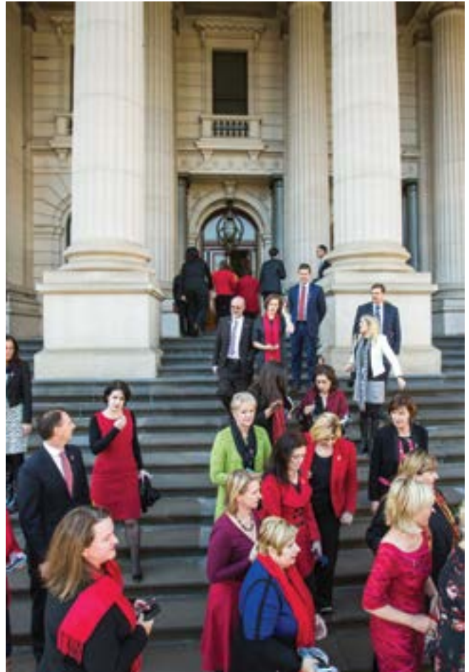
Above: The steps of Parliament House, Spring Street, Melbourne.

The concept of common law is hundreds of years old and goes back to when there was little or no written legislation. At this time judges referred to other judges' decisions to ensure that matters coming before the court were treated consistently.