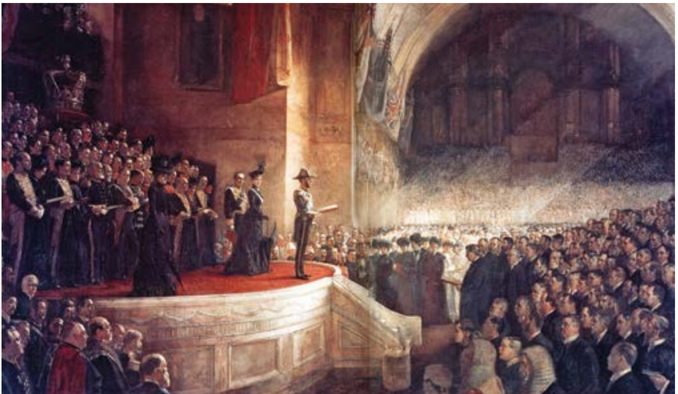
Below: Tom Roberts, The Opening of the First Parliament of the Commonwealth of Australia by HRH the Duke of Cornwall and York, 9 May 1901 (1903).