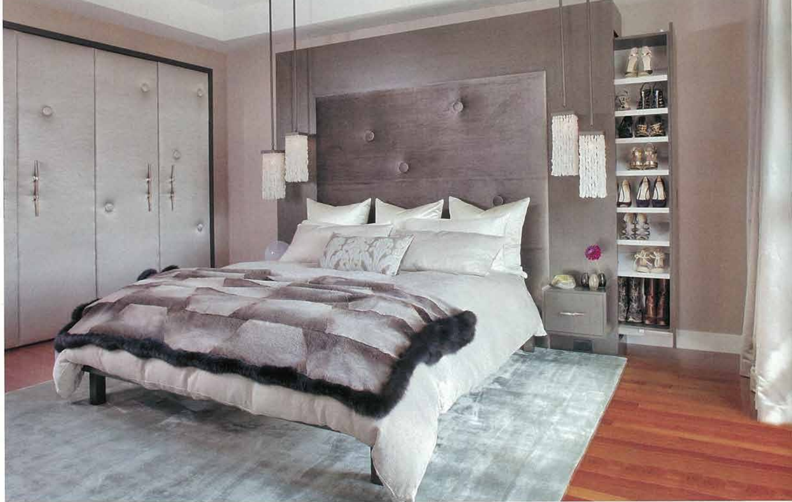
Above: Richards upholstered the master bedroom's custom closet doors with a Romo fabric and chose pulls from Ochre. Rock crystal pendants by Fuse Lighting flank the bed, for which Meade designed a built-in cabinet for shoes. Right: A Fromental wallpaper backs a mirrored cabinet from Whitney Evans Ltd.