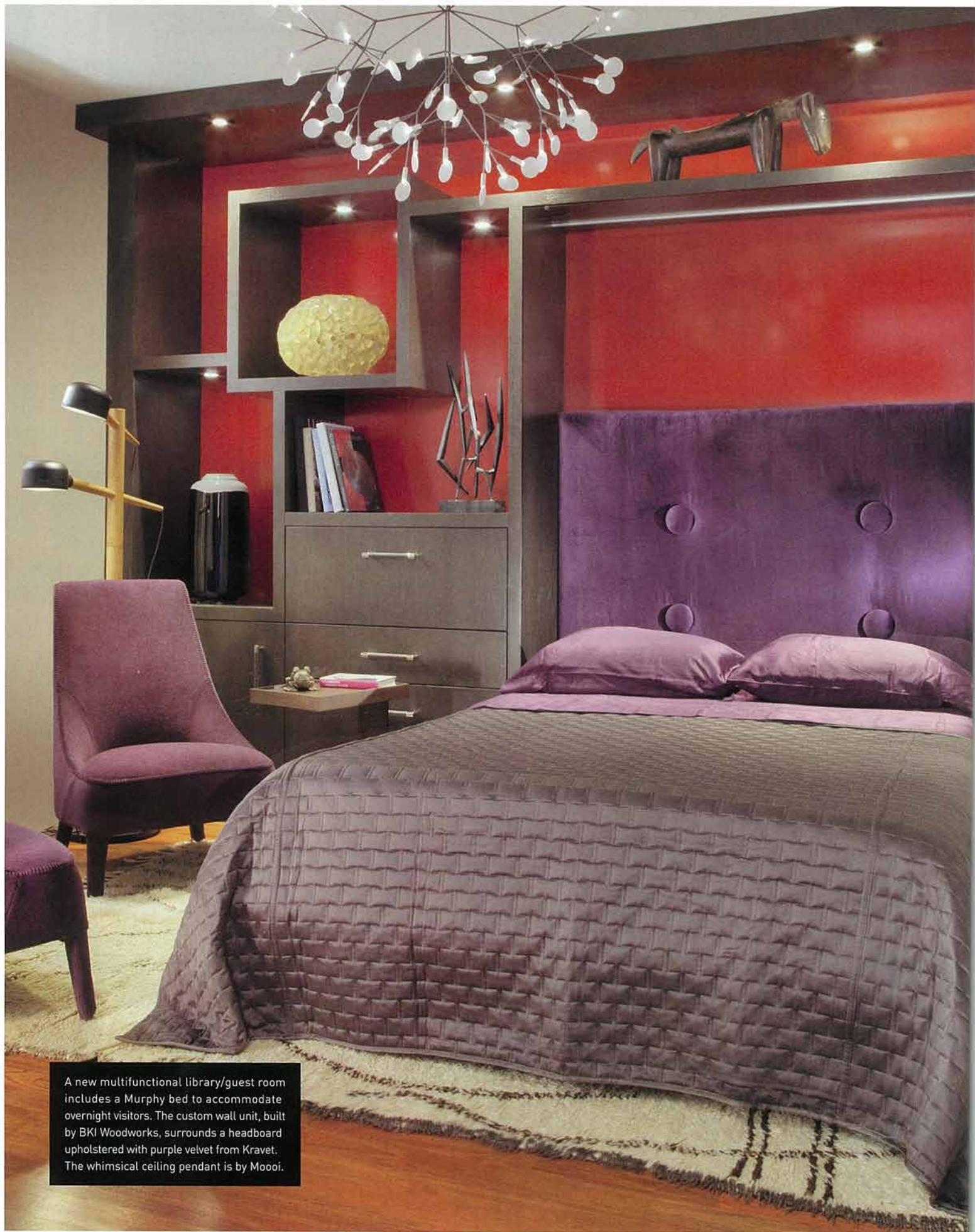
A new multifunctional library/guest room includes a Murphy bed to accommodate overnight visitors. The custom wall unit, built by BKL Woodworks, surrounds a headboard upholstered with purple velvet from Kravet. The whimsical ceiling pendant is by Moooi.