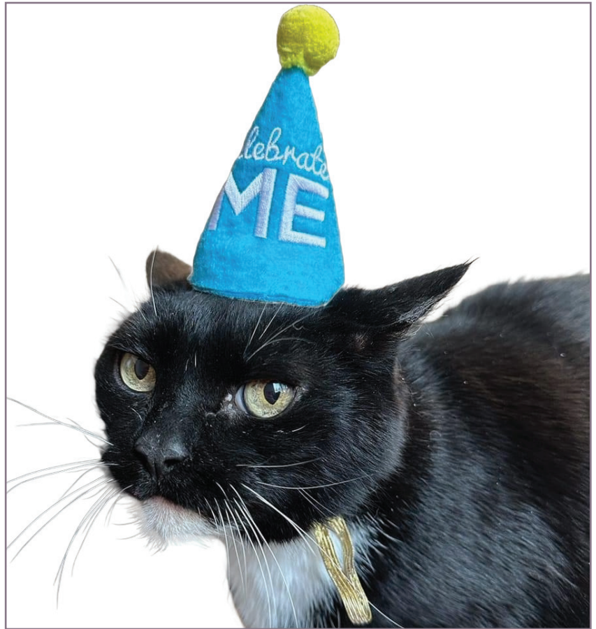
Celebrate Armani!

834 cats and kittens adopted and living with their forever families