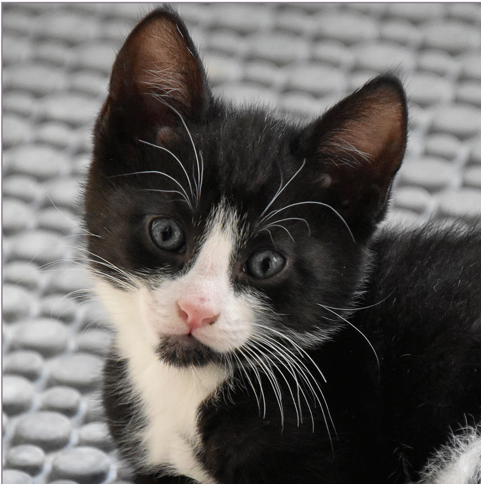
Mocha.