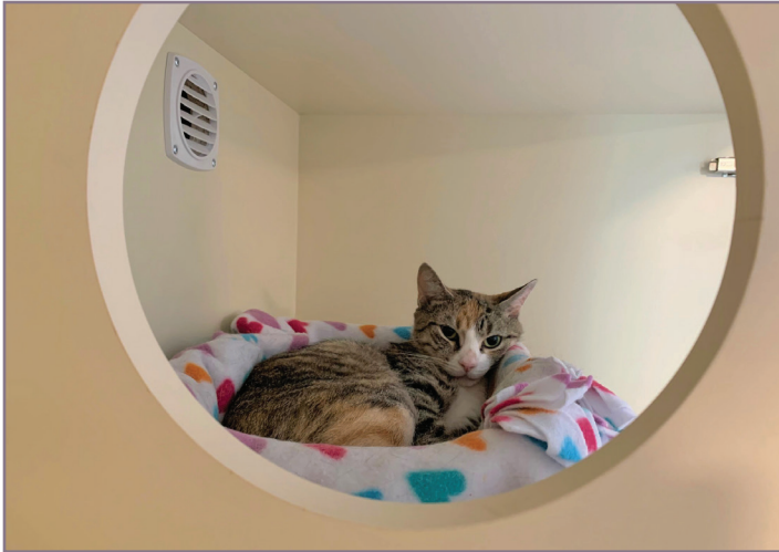
Violet.

Our New Cat Condos Were Designed with Cats in Mind