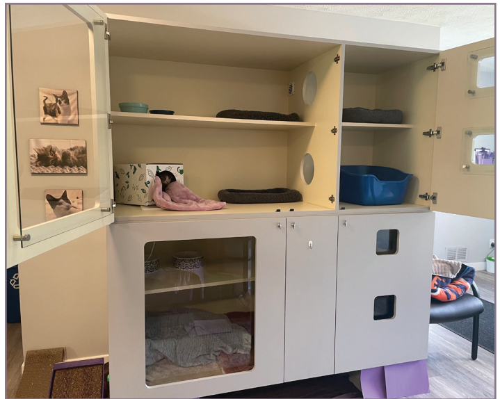
One of our new condos.

Violet, initially stressed and wary, used the private space for several days after arrival to decompress and become acclimated to her new surroundings. She has since ventured out into the sanctuary and has shown her true affectionate and playful nature. We’re confident that, by the time this newsletter goes to press, Violet will have found her forever home. 🐾