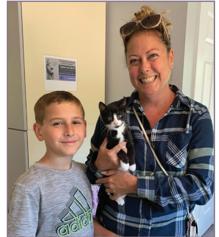
Mocha goes home!

Once they are transferred to our newly renovated and expanded sanctuary, kittens will stay in our new Kitten Kingdom while they await adoption. There they can thrive in an enriched environment built just for them, and they won't have to be transported to and from the sanctuary to meet with prospective adopters anymore. They'll just take a short trip down Tabby Lane to one of our new Meet-and-Greet Rooms , where the magic happens! 🐾