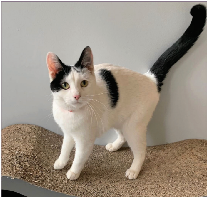
Aria.