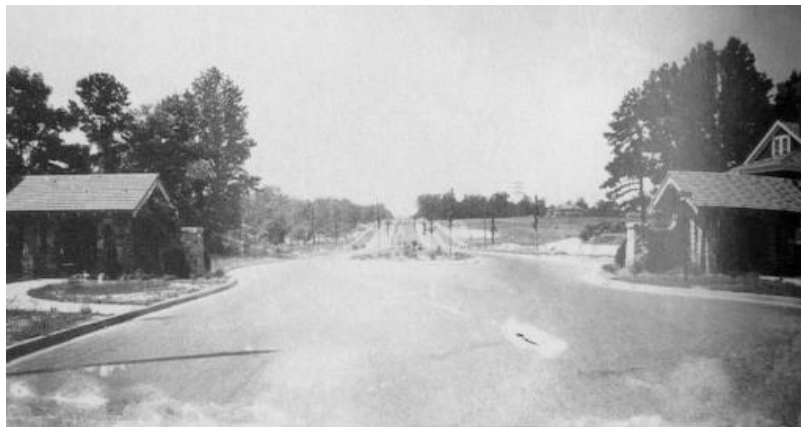
Sunset Hills was a gated community. This is the view on the eastern edge of the community looking west on Market Street. The gate entrance was where the current Aycock overpass is now.