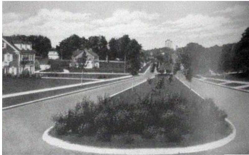
Sunset Hills, looking towards downtown. Picture taken approximately 1930

Sunset Hills was established in 1924. Once considered the outskirts of Greensboro, today it rests in the heart of the city with over 840 residences, a dozen churches, and several samplings of fine restaurants. Its informal borders range from Friendly Ave. down Elam Ave. across to Walker Avenue over to Aycock Street, see attached map. It is proud of its diverse residents from all walks of life and backgrounds. A walk through Sunset Hills offers great views of many types of architecture and beautiful yards. Make sure to stop by the Sunset Hills Park, a wonderful natural “greenway” that contains various playground equipment and tennis courts. It is conveniently located on Greenway and runs from Friendly Ave. across Market Street to Berkeley. It is also home to many neighborhood association functions such as the famous Easter egg hunt, pig pickin’ and 4 th of July parade.