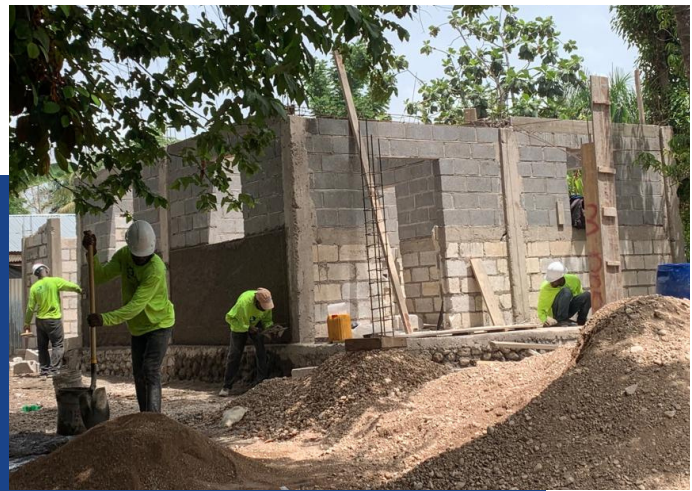
New house under construction.