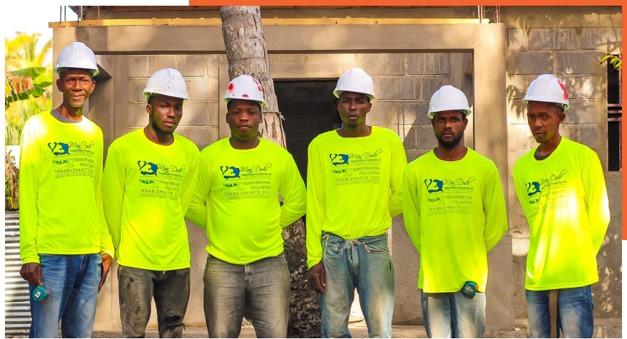
Man Dodo Construction Team - Supporting Economic Development by hiring local experienced builders.

one-bedroom house was destroyed by the earthquake. With the help from a local church, they were provided with plywood and tarps to build a temporary shelter, which was unfortunately vandalized and set on fire by thieves - the same thieves who previously stole the hand-crafted cooking pots they were preparing to sell at the marketplace, as their only source of income for the next few months. The family of 11 was forced to find refuge in a makeshift 100 square foot space, sleeping on beds set on broken cylinder blocks and rocks.