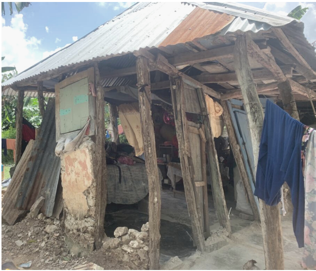
Damaged from earthquake, 2021