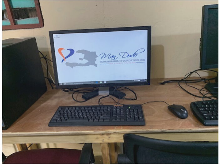
Computer lab at Institution Marguerite d'Youville destroyed by the 2021 Earthquake

Sadly, the August 2021 earthquake also destroyed the first computer lab we built and inaugurated in October 2020 at the Institution Marguerite d'Youville in Cavaillon, along with all corresponding school buildings.