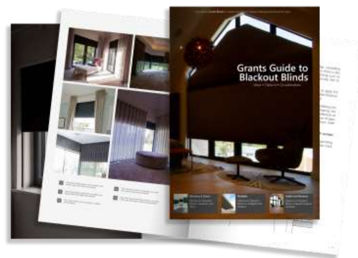
Guide to Blackout Blinds