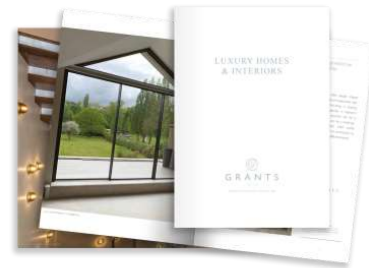
Luxury Homes & Interiors Brochure