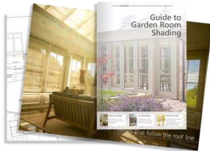
Guide to Garden Room Shading