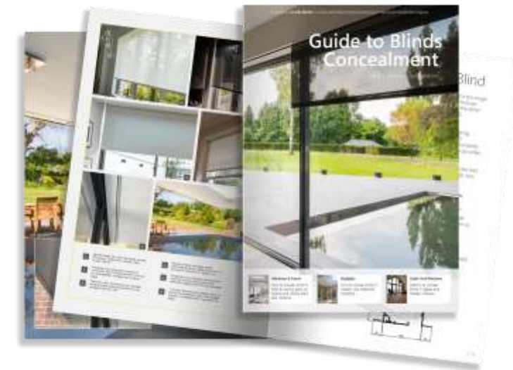
Guide to Blinds Concealment