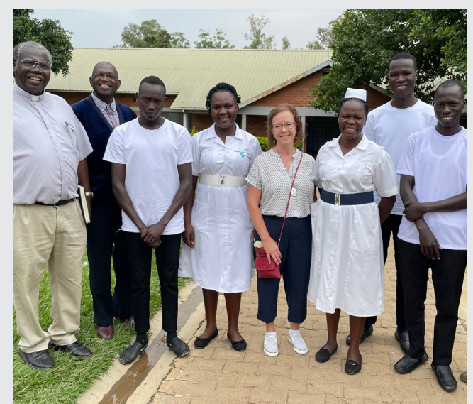
AFSS students have a reputation for being very disciplined and excellent nursing candidates.

There are many more ways in which we support our students to become the leaders of tomorrow. From competitions among residential housing to the all-important celebrations that follow their