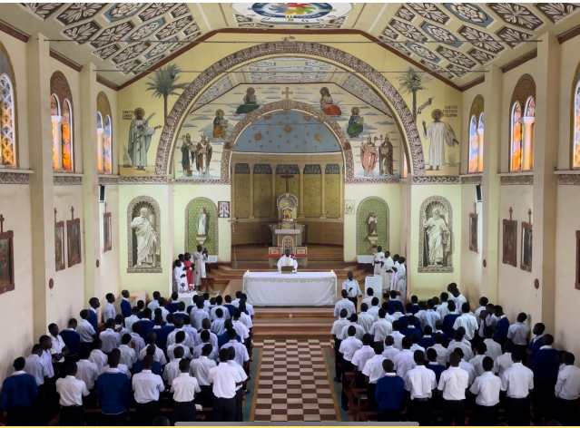
Celebrating Mass with SHS seminarians was a highlight of our visit.