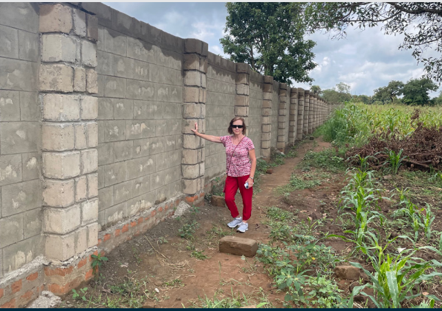
The ¾ of a mile of completed security wall & fence will keep animals and intruders off the AFSS campus. Thank you for making this possible!

This year we celebrate funding grants approaching $900,000, including the full scholarship needs requested by SHS and AFSS, as well as completing the long-awaited security fence surrounding the AFSS campus; the completion and dedication of the Priest