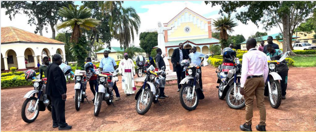
HFU benefactors provide recently ordained priests with new motorcycles.

Remember, you can visit our website for status updates and additional details for current and past projects ( www.hopeforuganda.org/projects ). God bless you!