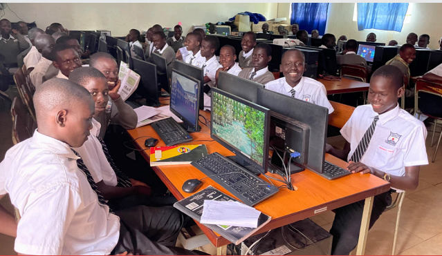
AFSS students pack the small computer lab and eagerly await additional space and equipment.