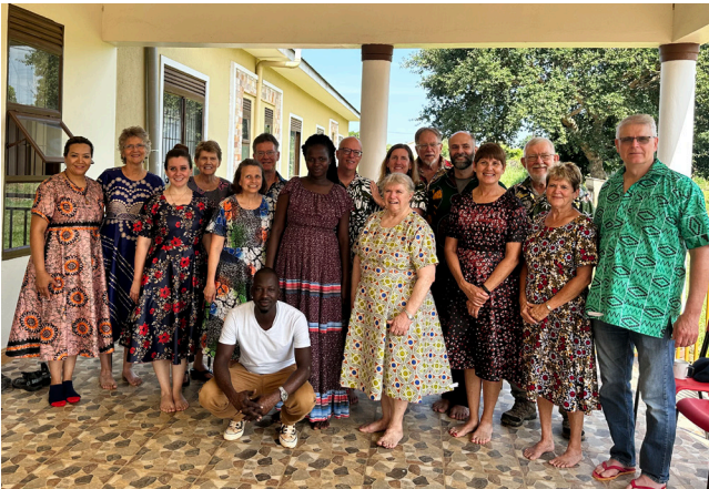
IHM pilgrims wear custom-made clothing received from the AFSS community.

My biggest takeaway was this: There is a very real distinction between charity and generosity. Charity is the compassionate response to a person or persons in need. This defines the work of Hope for Uganda – to share the real-life stories of our sisters and brothers in Northern Uganda, and to inspire charity. Generosity is what we witnessed and experienced in Uganda. Generosity is the overflowing of gratitude and grace that has no basis in need at all. It is a pure gift out of the kindness of one’s heart, and does not take into account the need on the part of the recipient. As pilgrims in a distant land, we were the benefactors of such beautiful generosity, from the warm welcome to the many thoughtful, useful, loving gifts our friends bestowed on us from their hearts. I strongly encourage anyone who wants to experience real generosity to meet it face-to-face in Northern Uganda. Charity and generosity are both forms of expressing love and there you will see them come together brilliantly. Praise God!