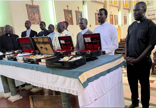
The 8 newly ordained priests receive their Mass kits funded by HFU.