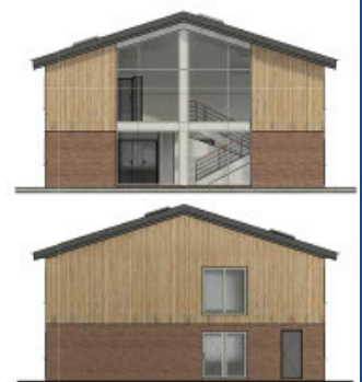
ELEVATION D 1:100