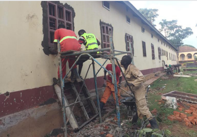
SHS Priest/Guest House renovation is underway – replacing wood-framed windows and doors with metal (to stop “feeding” the termites).

We praise the Lord for the generosity of all Hope for Uganda benefactors. Your recent support has made it possible to initiate many important projects, namely to begin construction of the long-awaited security fence at AFSS, repair and paint the SHS church, renovate the priest/guest residence at SHS, and build a corn crib at the Farm to reduce crop losses. Phase 1 of the Technology Upgrade – installing WiFi capability on both campuses – is also underway and should be completed by the end of summer. Excitement for all of these projects is palpable. Thank you so much!