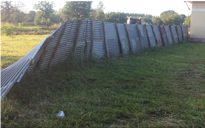
AFSS boys use this makeshift outdoor “shower” while waiting for funding for bathroom/shower renovation.