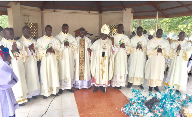
These 8 deacons are preparing for ordination to priesthood this summer. Please help them secure motorcycles, Mass kits, and chasubles.