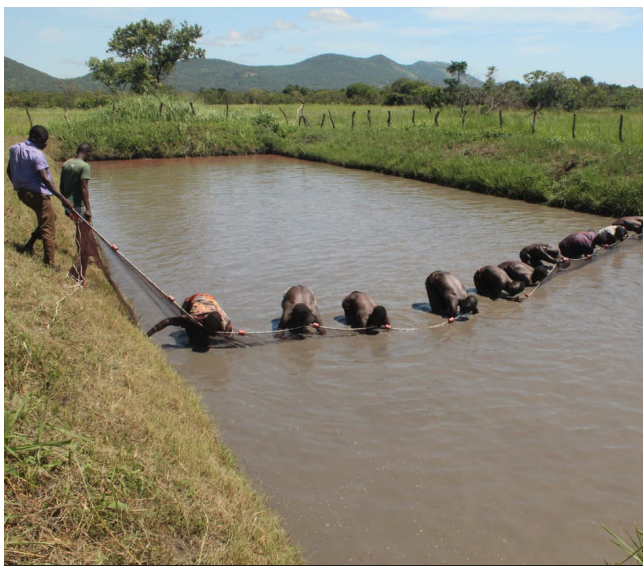
Netting fish from Farm fishery to feed students.