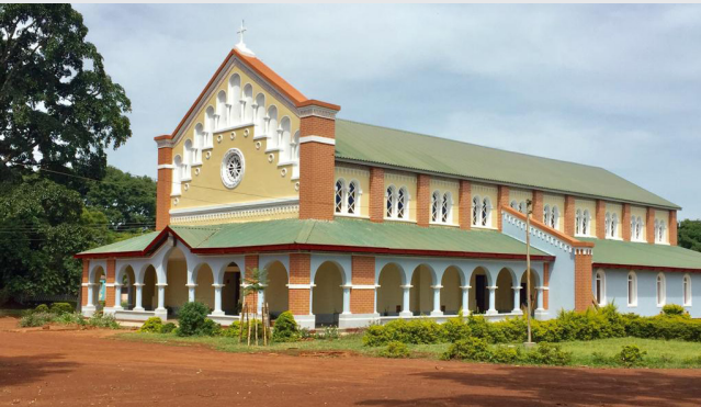
Beautiful! SHS campus church maintenance and repairs have been completed – thank you!

Eight new priests will be ordained in the Archdiocese of Gulu in early August. It is an extraordinary blessing to have these young men positioned to minister to the growing Catholic community in Uganda. Researchers are projecting that Uganda will be ranked in the top 10 Christian populations in the world by 2050. Please help us raise $36,000 to provide motorcycles, Mass kits, and chasubles for these soldiers for Christ.