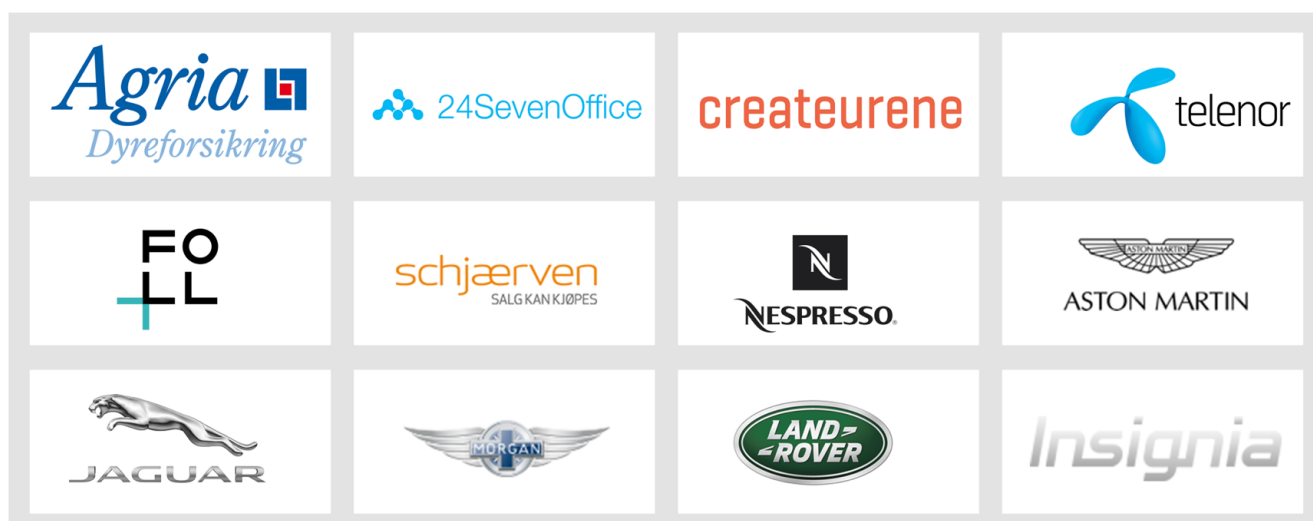
Signed TargetEveryone brands