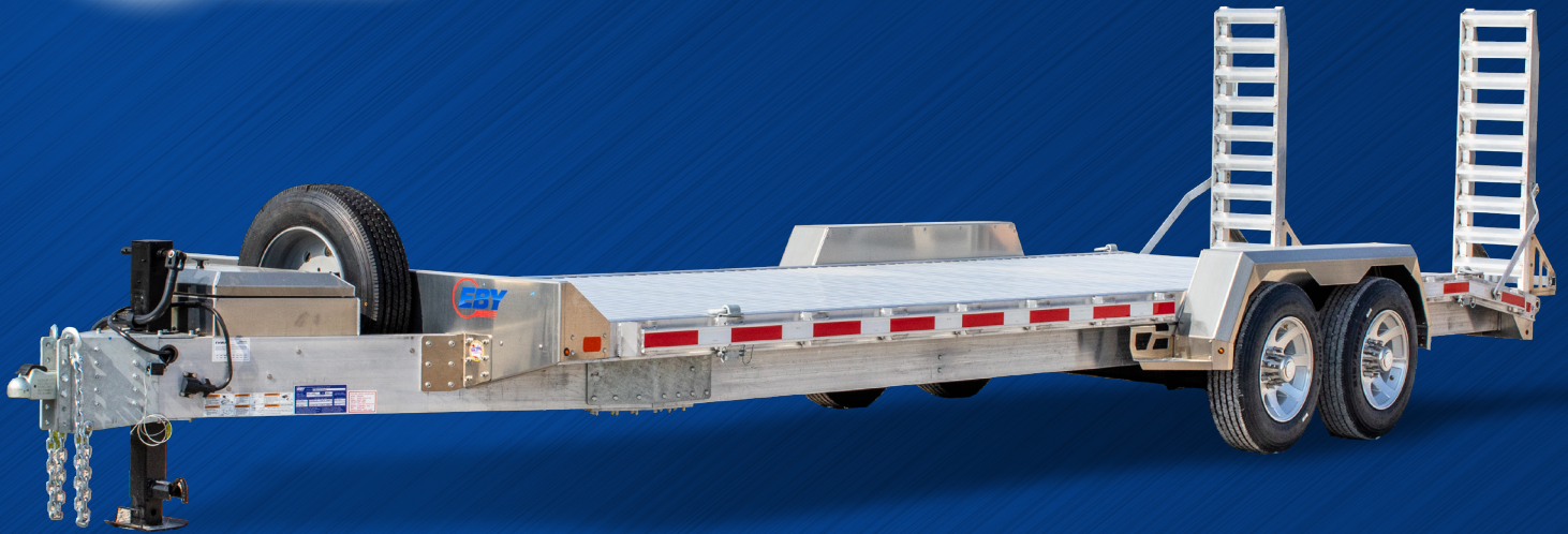
14K Low-Profile (shown with optional equipment)