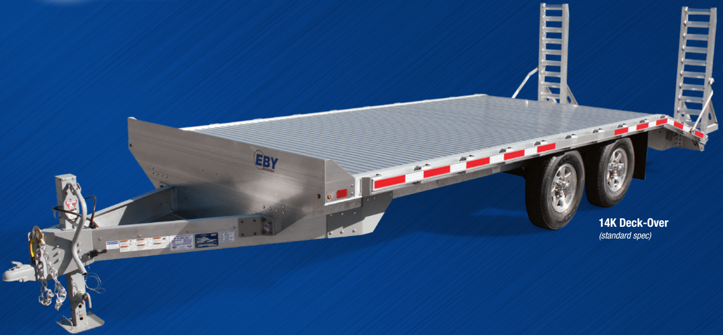
14K Deck-Over (standard spec)