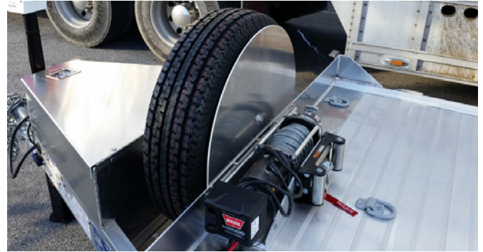
Outfit your trailer with a lockable A-frame toolbox, spare tire, winch and more!