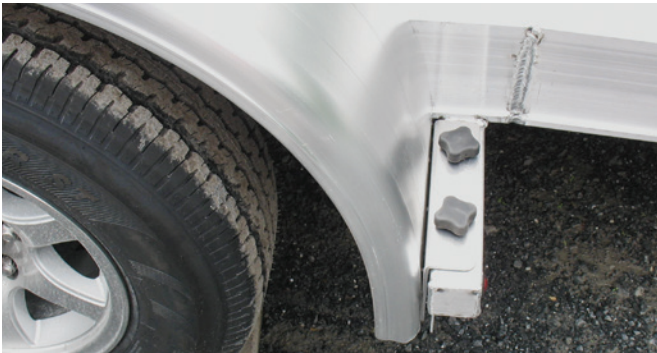
Fenders are removable for extra clearance when loading and off-loading